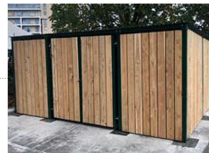
New discrete timber bin store