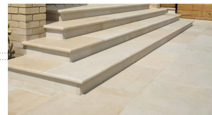
New bullnose limestone steps and limestone paving