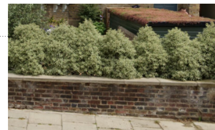
New hedgerow planting

P 1 17/10/22 Planning Detail REV. DATE COMMENT