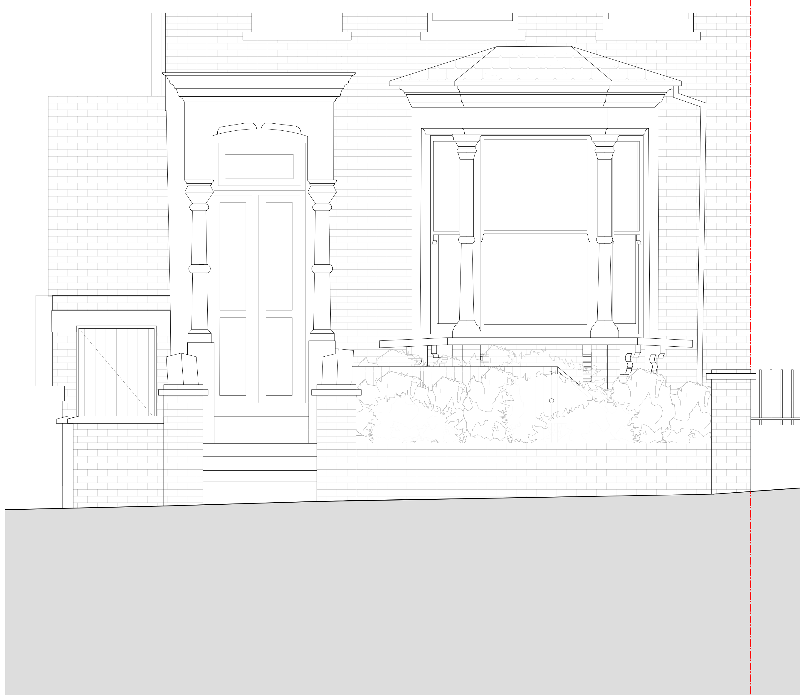
1 Proposed West Elevation Scale: 1:25