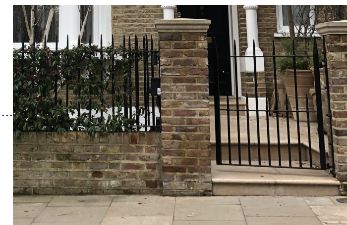
New black metal railings