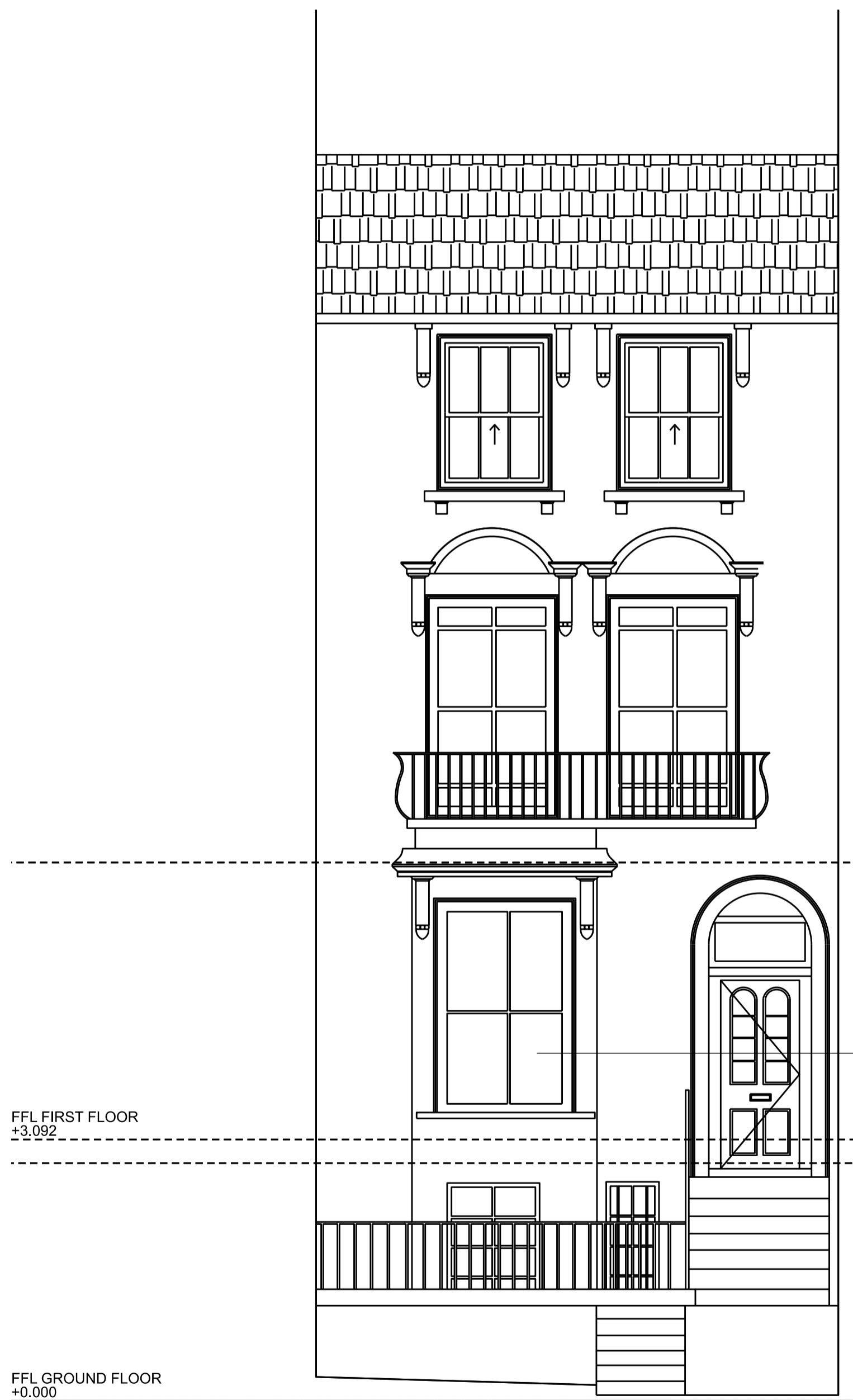
1 1:50 EXISTING NORTH WEST ELEVATION

THIS DRAWING IS PROTECTED BY COPYRIGHT AND MUST NOT BE COPIED OR REPRODUCED WITHOUT THE WRITTEN CONSENT OF CHRIS DYSON ARCHITECTS LLP. NORTH POINTS SHOWN ARE INDICATIVE. ©