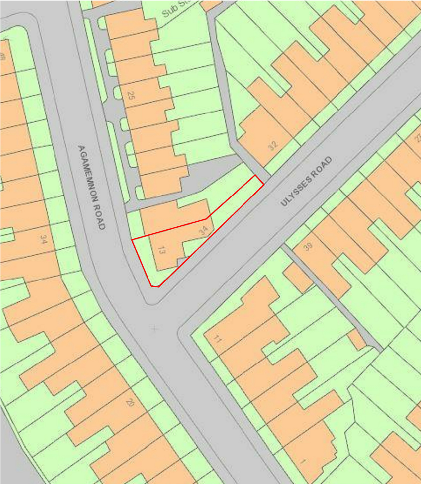
BLOCK PLAN 1 : 500 @A3