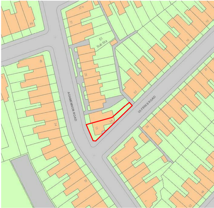
LOCATION PLAN 1 : 1250 @A3