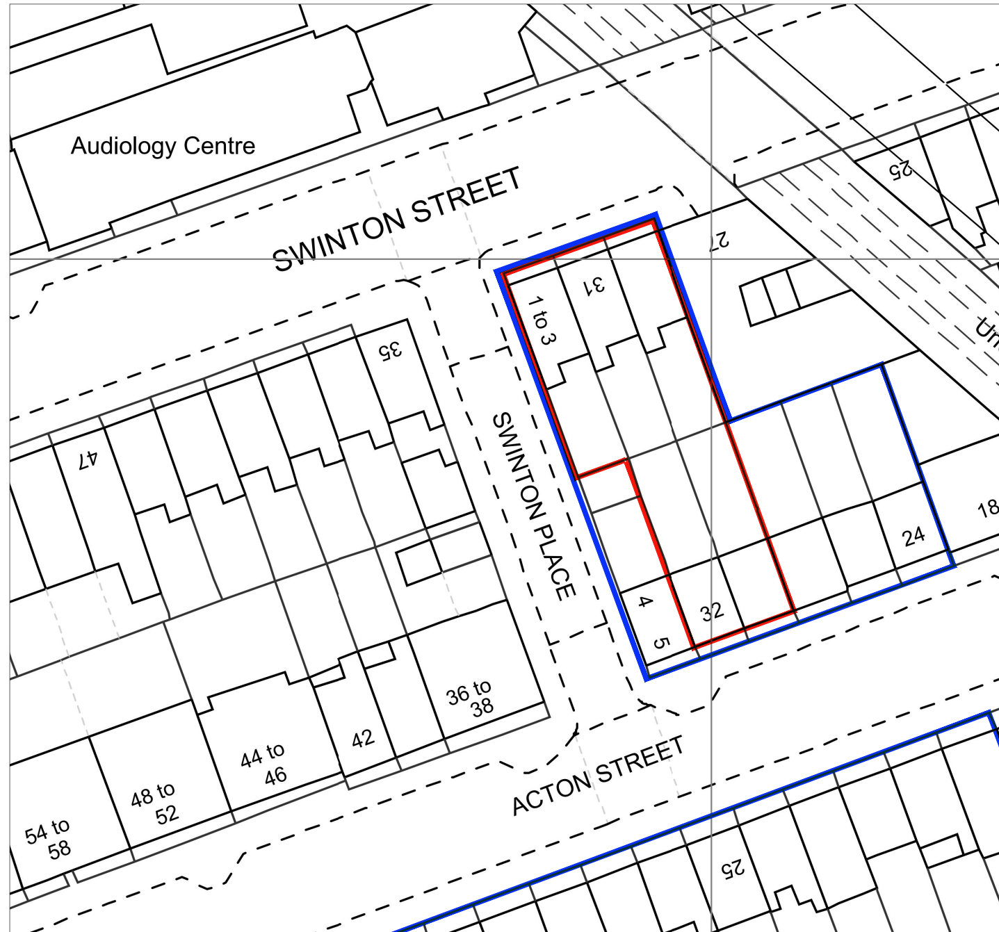
2 Block Plan Scale: 1:500 @ A3 Scale Bar 1:500 5 0 5 10 25 m