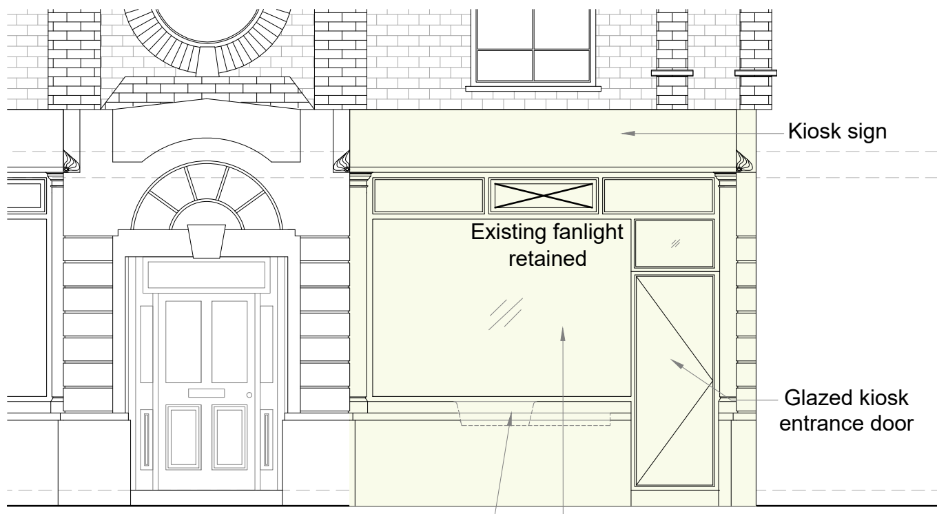
03 -PROPOSED KIOSK ELEVATION SCALE 1:50