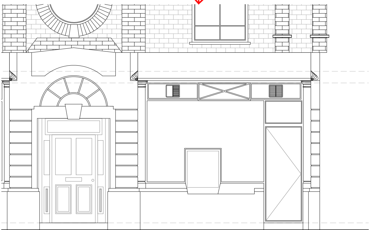
02 -EXISTING KIOSK ELEVATION SCALE 1:50