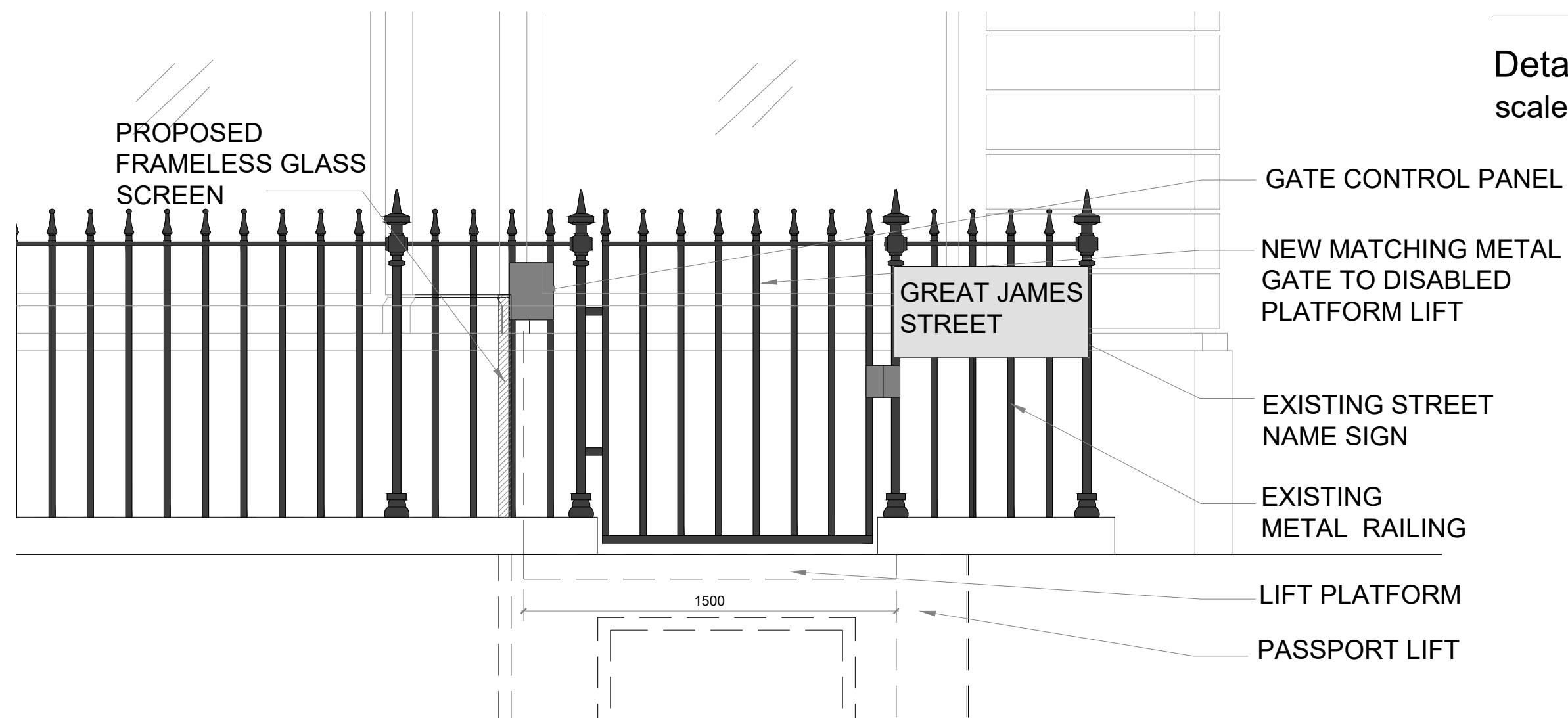
Detail 02 - Proposed Disabled platform lift gate scale 1:20