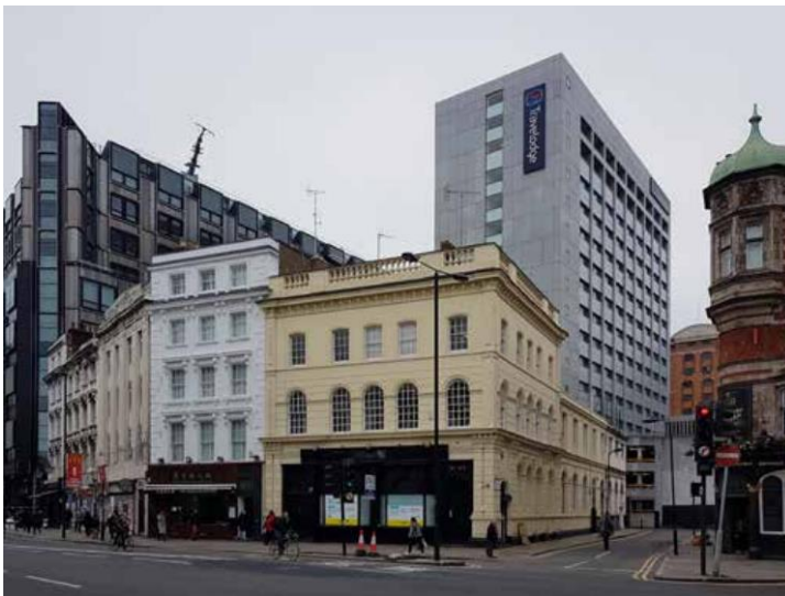
Figure 1 View of existing site from West Central Street

The existing site comprises of 0.52 hectares and is bounded by High Holborn to the south, Museum Street to the east and New Oxford Street to the north, with the rear of the properties fronting Grape Street forming the western boundary.