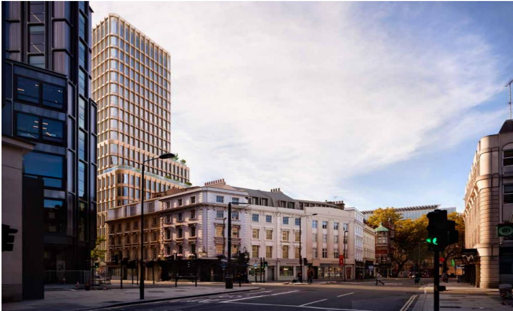
Figure 2 Proposed Development from Bloomsbury Way

The proposed development comprises of redevelopment and extension to provide a mixed-use scheme of affordable housing, town centre uses and 22,650m 2 of office floor space within the new 19 storey building on Museum Street. 500 cycle parking spaces to be allocated and a high proportion of open spaces across the site providing a public realm.