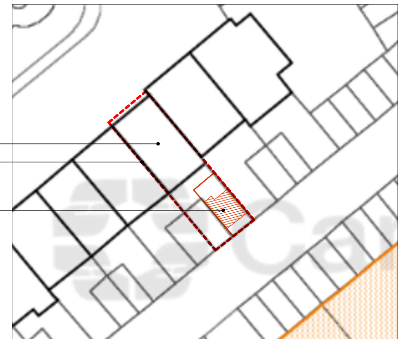
03 - Site Plan