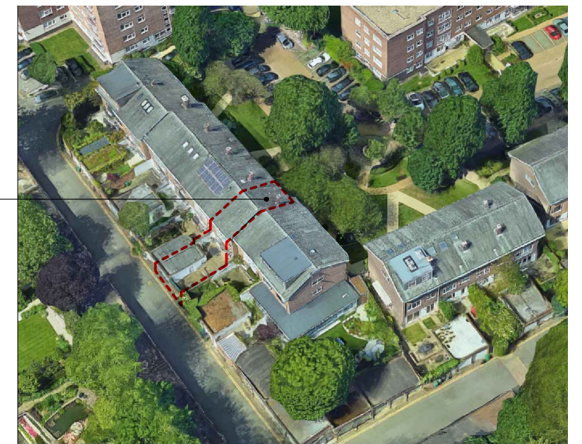
04 - Aerial View Of The Site