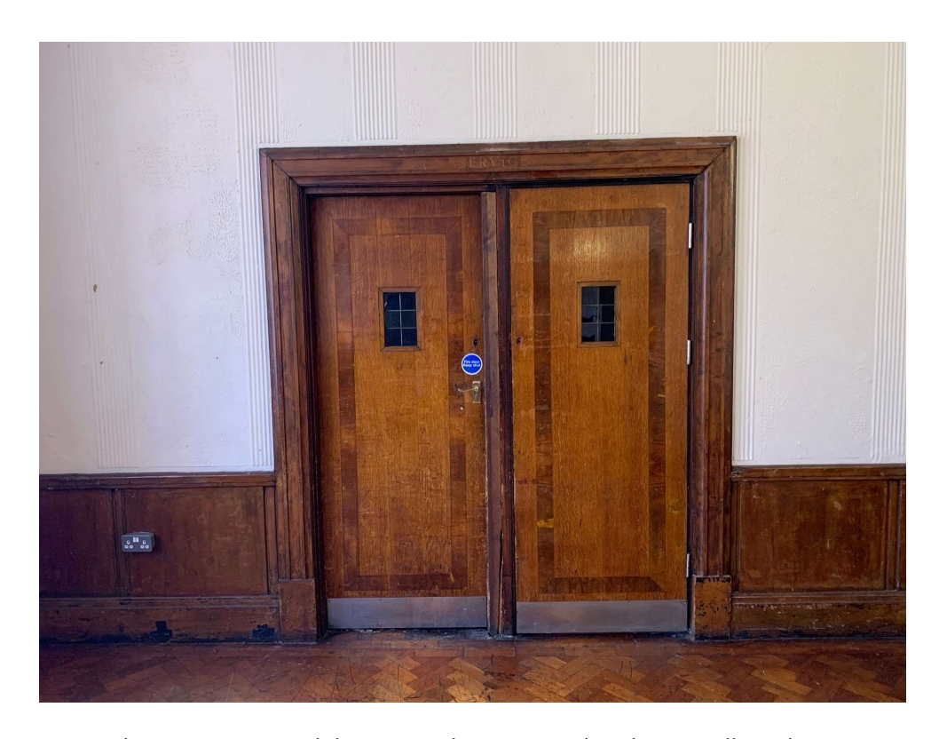
Photo 003 - Original door to Kitchen area and timber panelling along lower section of wall