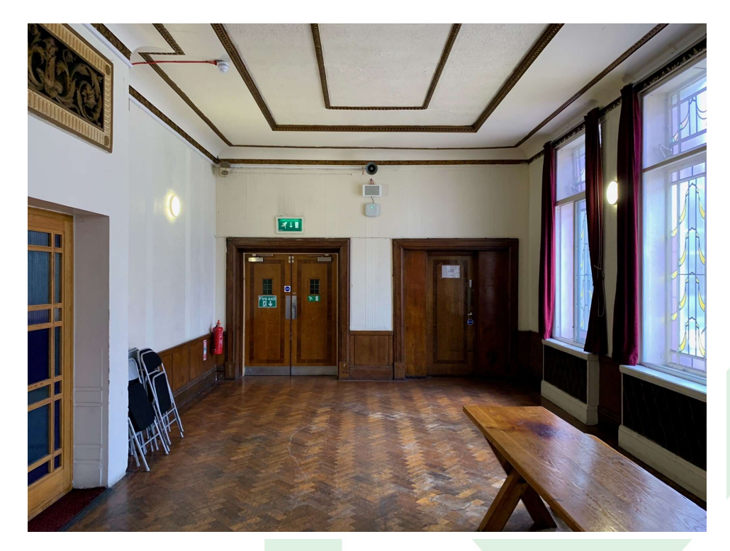
Photo 004 - Photo of far end of the room showing 2 no. original doors, timber panelling, timber floor and ceiling plaster