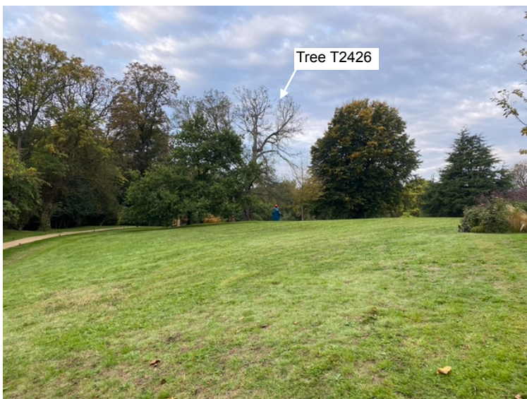
Declining form as viewed to south west within landscape