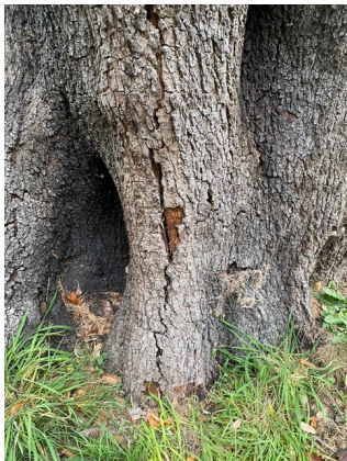
Eastern buttress with fracturing