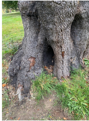
Southern buttress with fracturing and staining to initial main stem