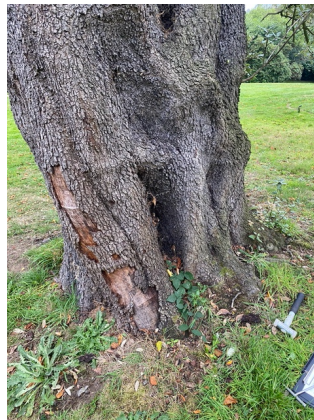
Northern buttress with fracturing