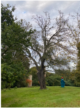
Tree T2426 viewed to the west showing declining form