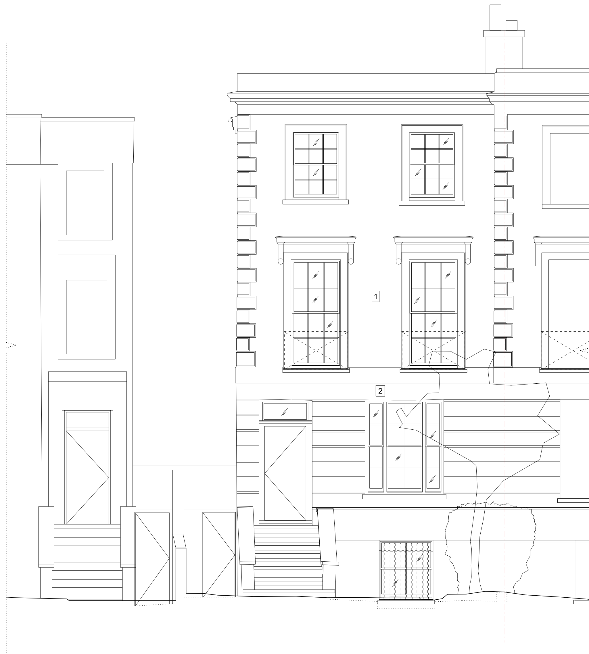
1 Front Elevation