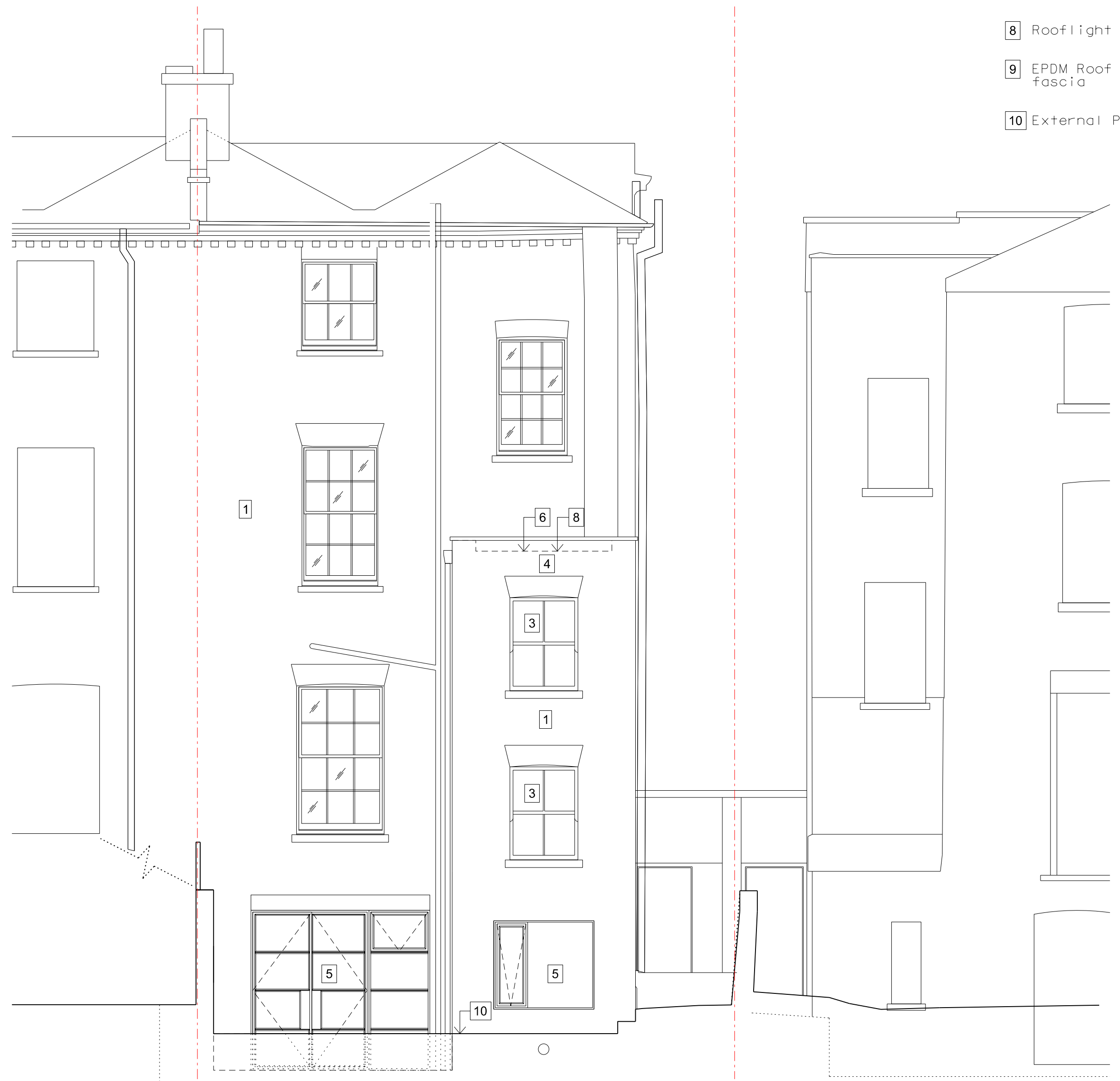
2 Rear Elevation