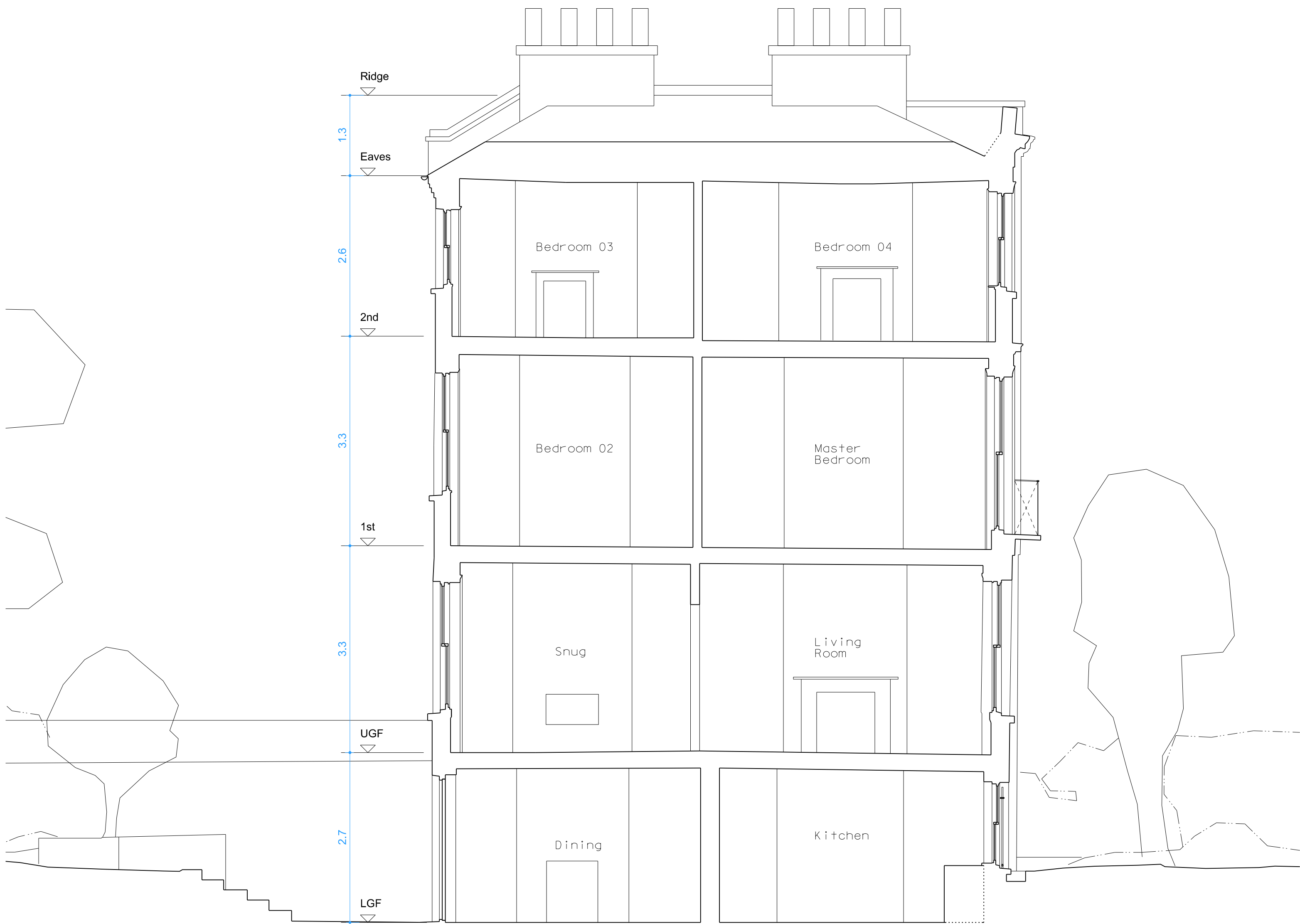
1 Section AA