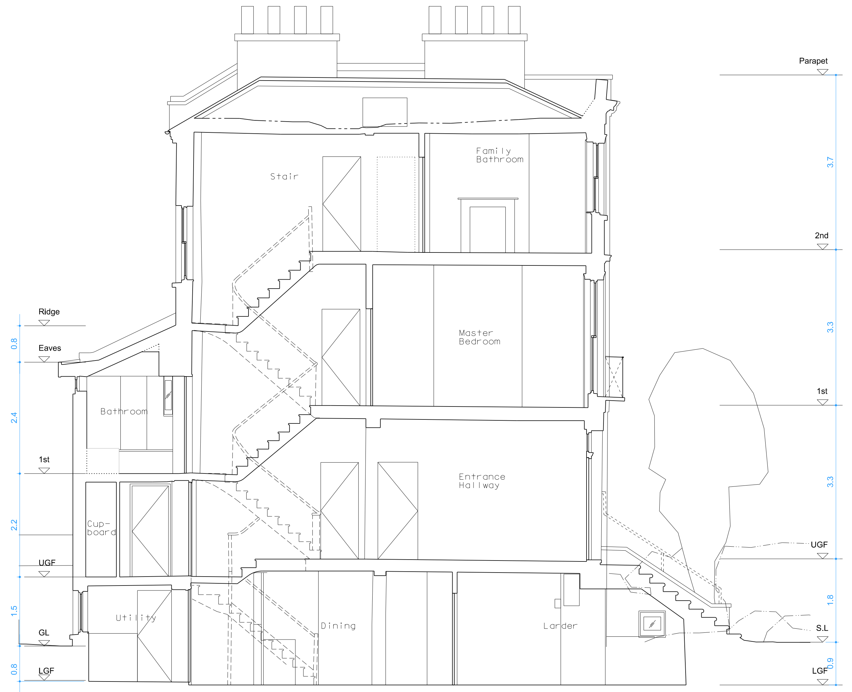
2 Section BB