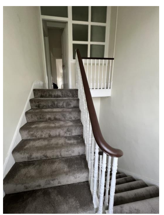
Photo D: Internal – Communal area, 3<sup>rd</sup> floor flat entrance