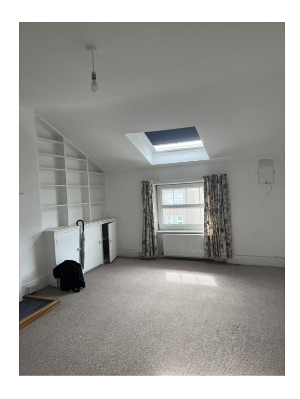
Photo F: Internal – Reception room overlooking the window and rooflight