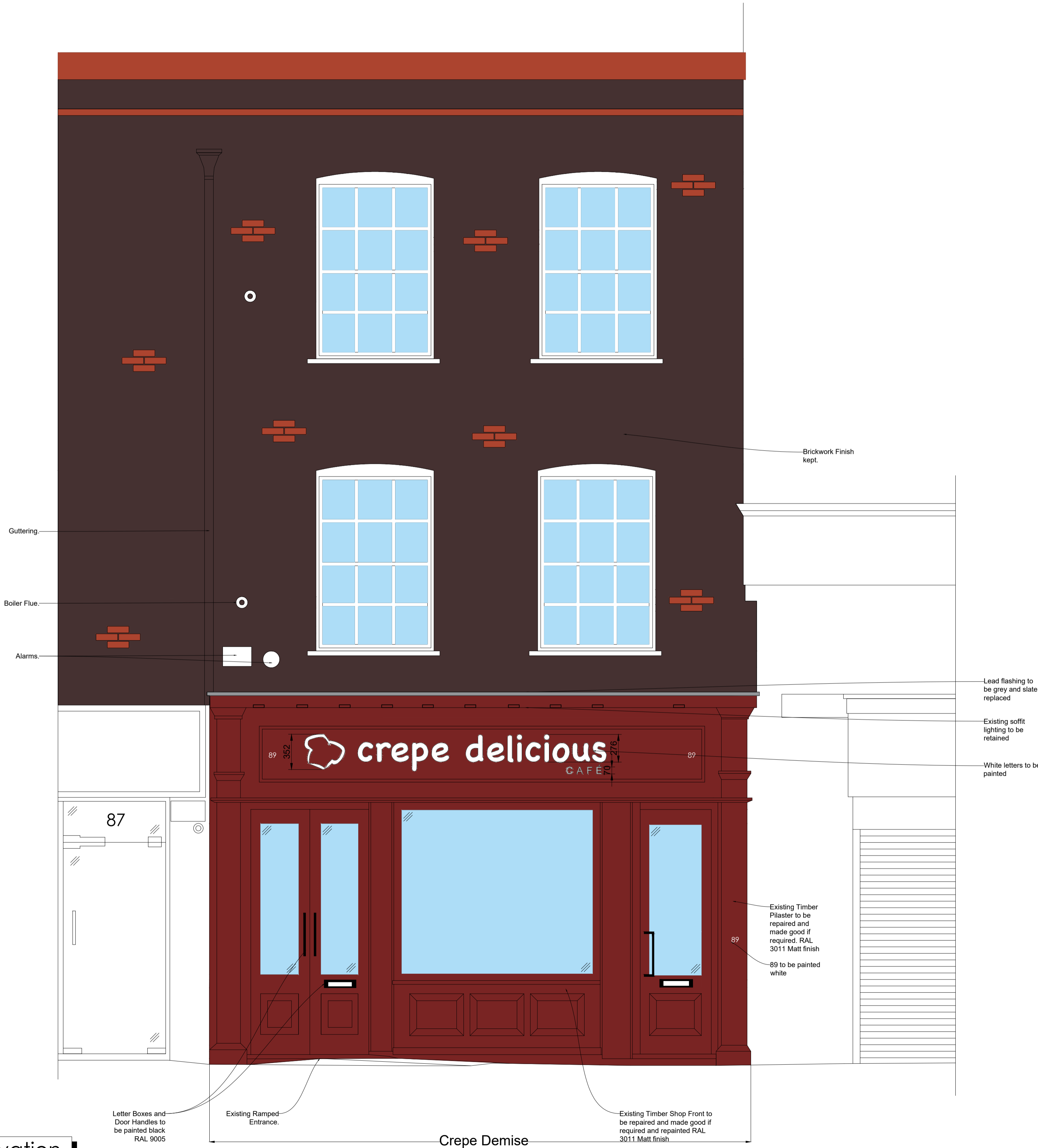
Proposed Front Elevation Scale 1:25 @ A1