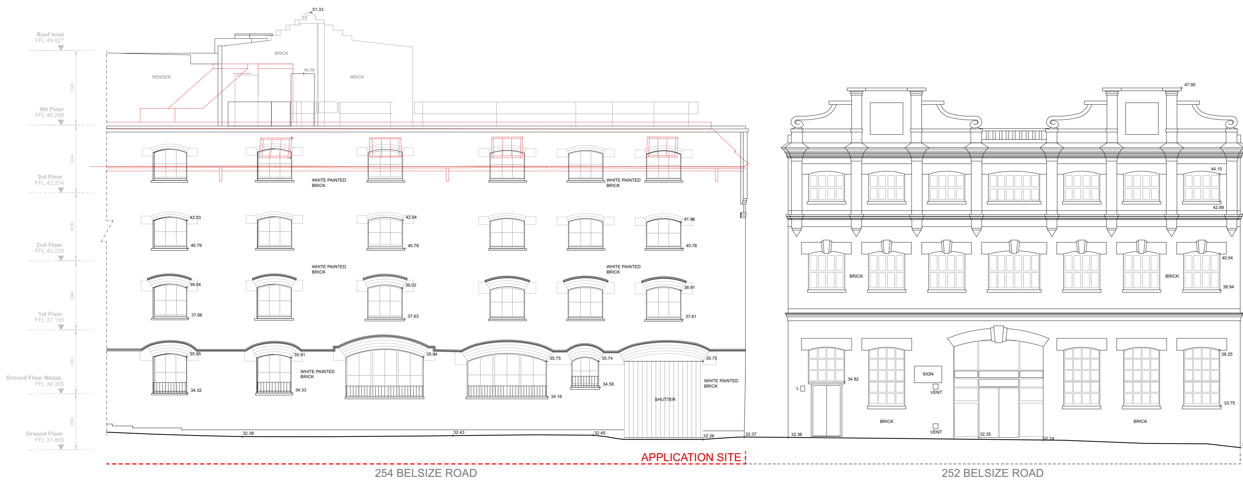
ELEVATION PART 2 (SEE KEY PLAN)

254 BELSIZE ROAD APPLICATION SITE 252 BELSIZE ROAD