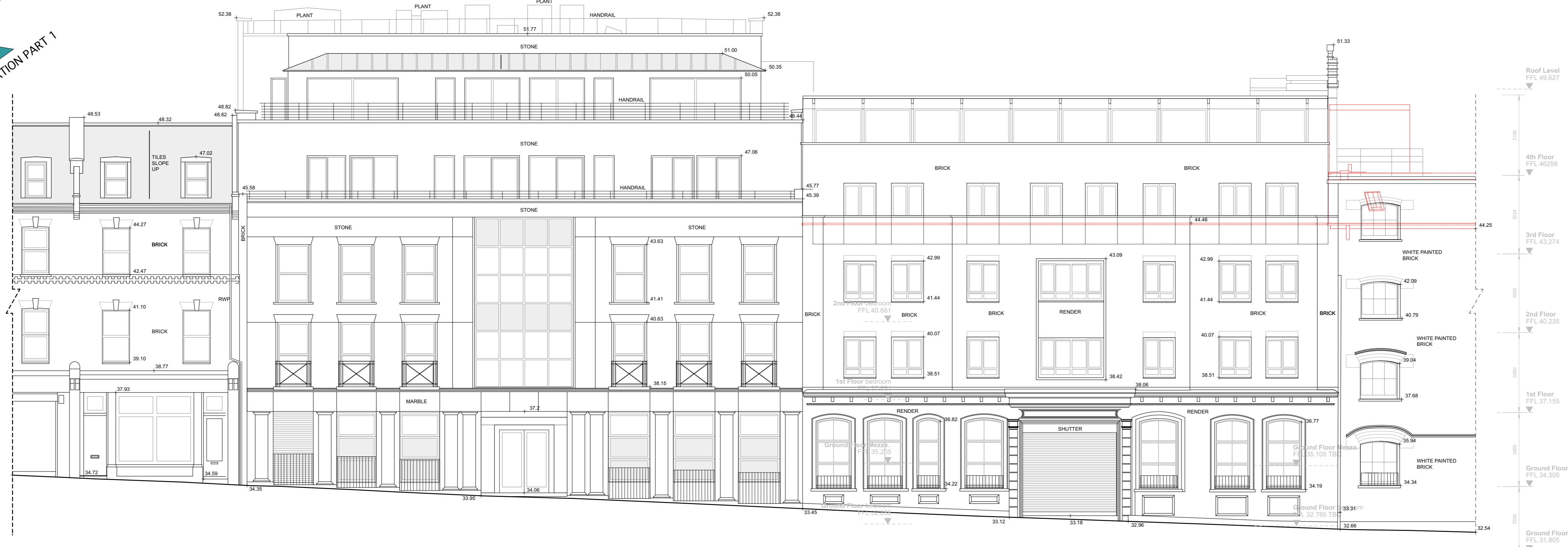
ELEVATION PART 1 (SEE KEY PLAN)

264 BELSIZE ROAD 258 BELSIZE ROAD APPLICATION SITE 256 BELSIZE ROAD 254 BELSIZE ROAD