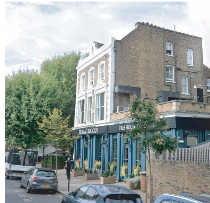
View from Hammond Street