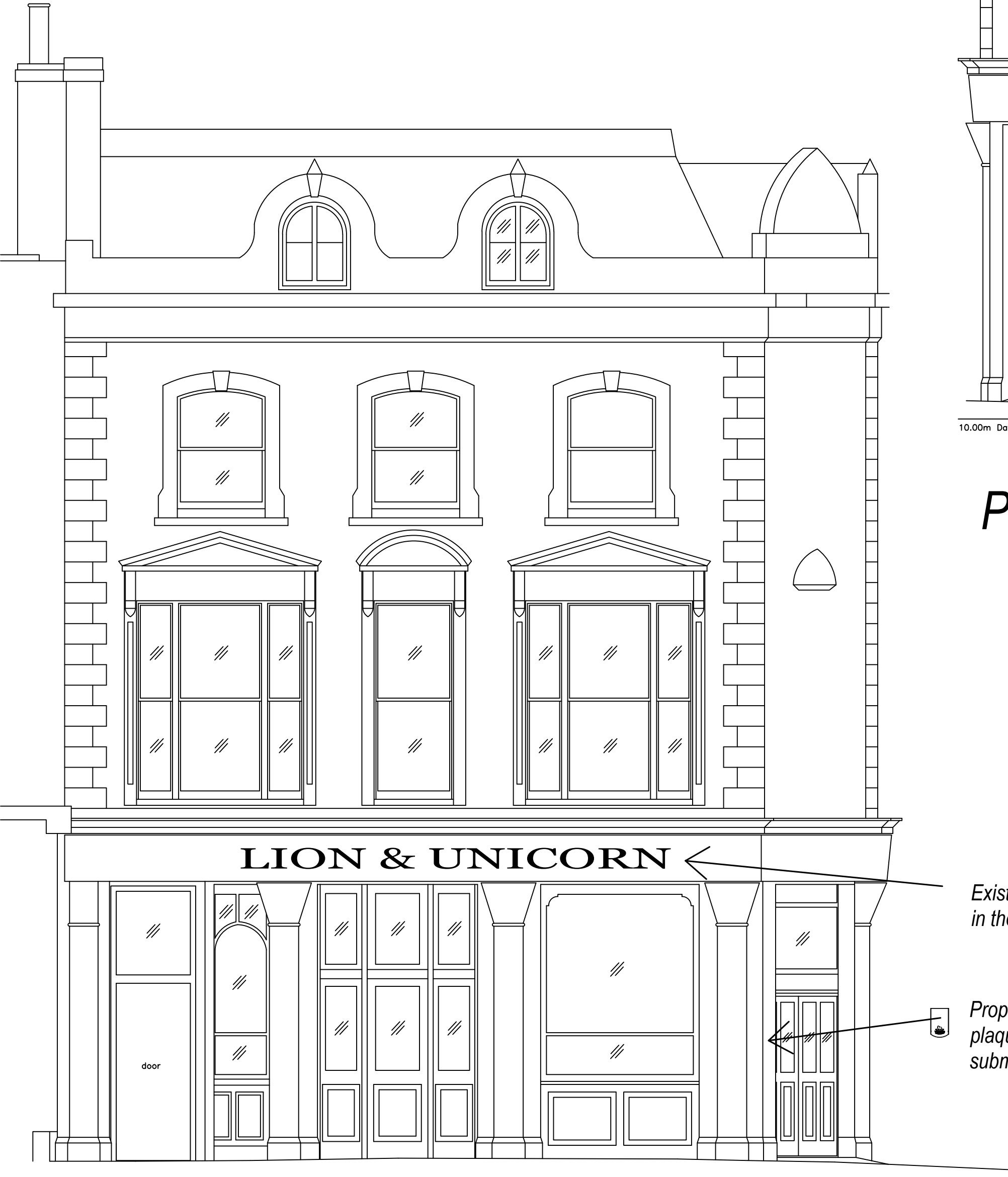
Proposed South Facing Elevation