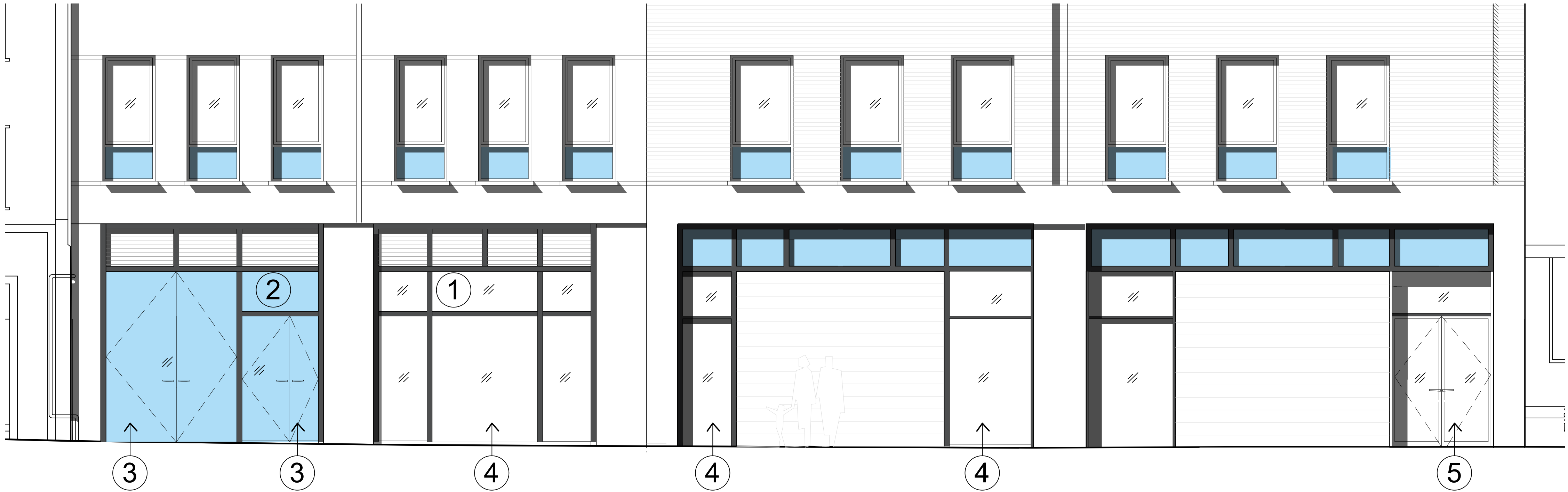
02 Detail Elevation Scale: 1:50

This drawing is copyright. This drawing must not be scaled. Figured dimensions, levels etc. are only to be used. Any inaccuracies, etc. must be notified to the architect. Detail drawings and larger scale drawings take precedence over smaller scaled drawings.