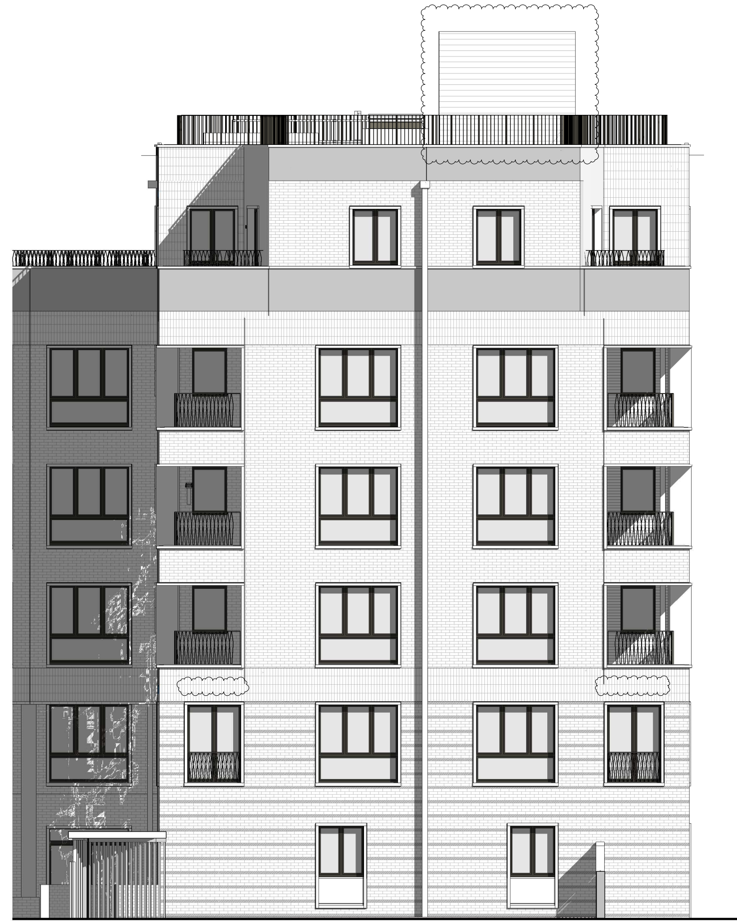
6 South Elevation (Courtyard) - Planning 1 : 100