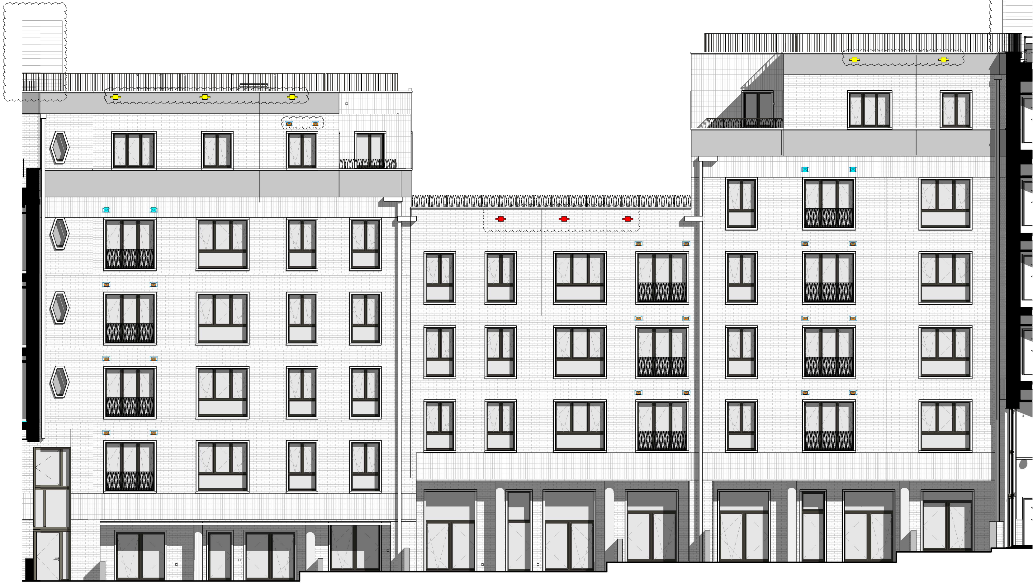
3 East Elevation (Courtyard) - Planning 1 : 100