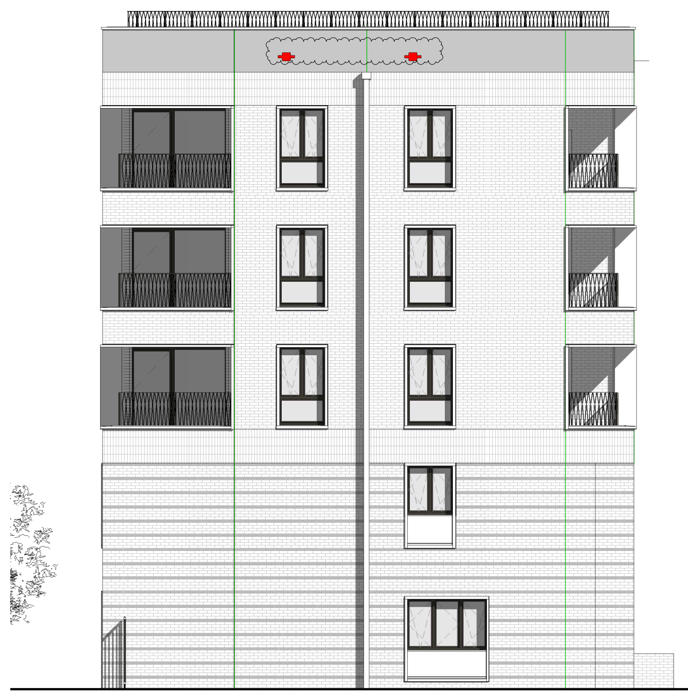
1 East Elevation (Courtyard) - Planning 1 : 100