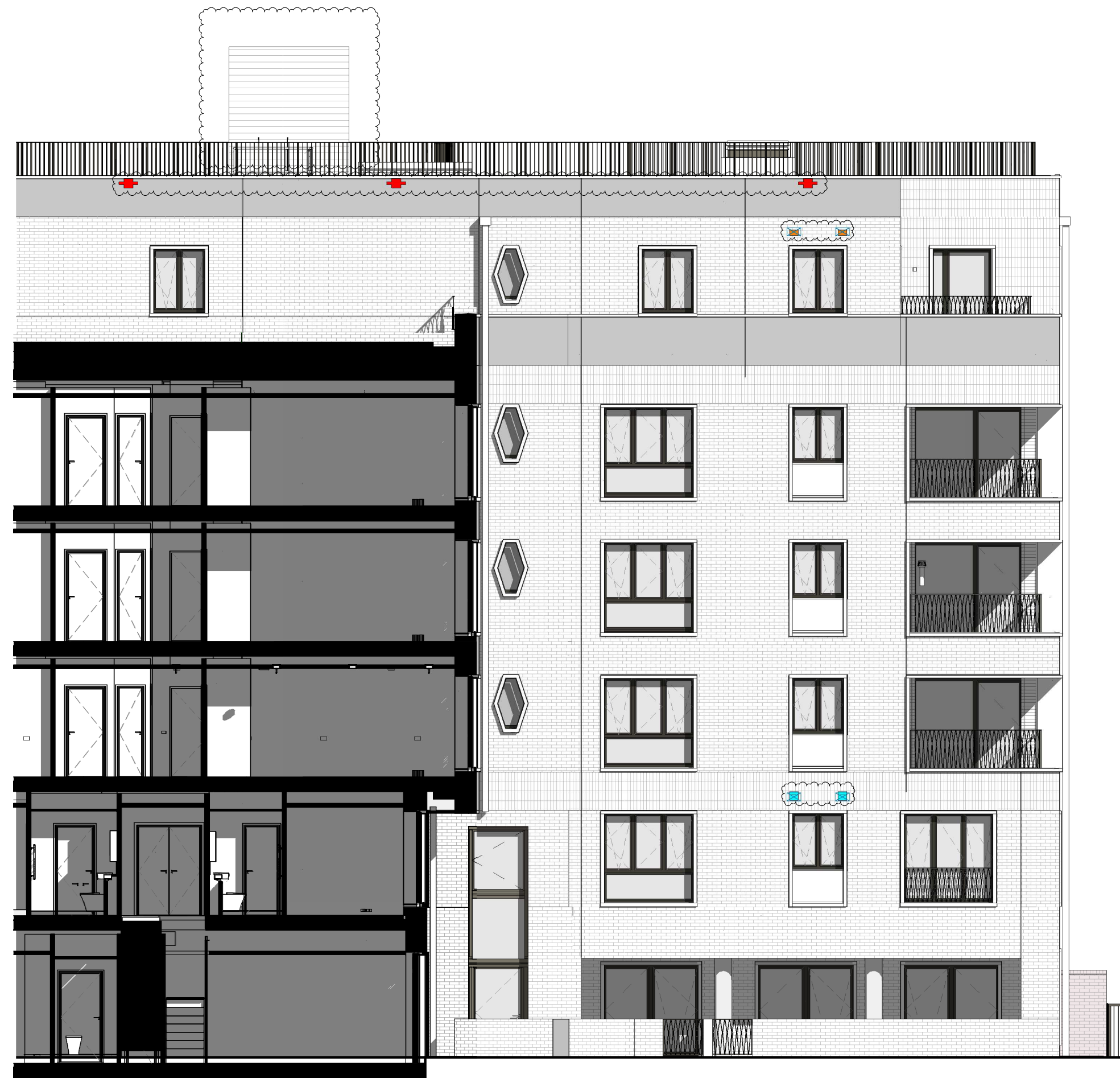
5 West Elevation (Courtyard) - Planning 1 : 100