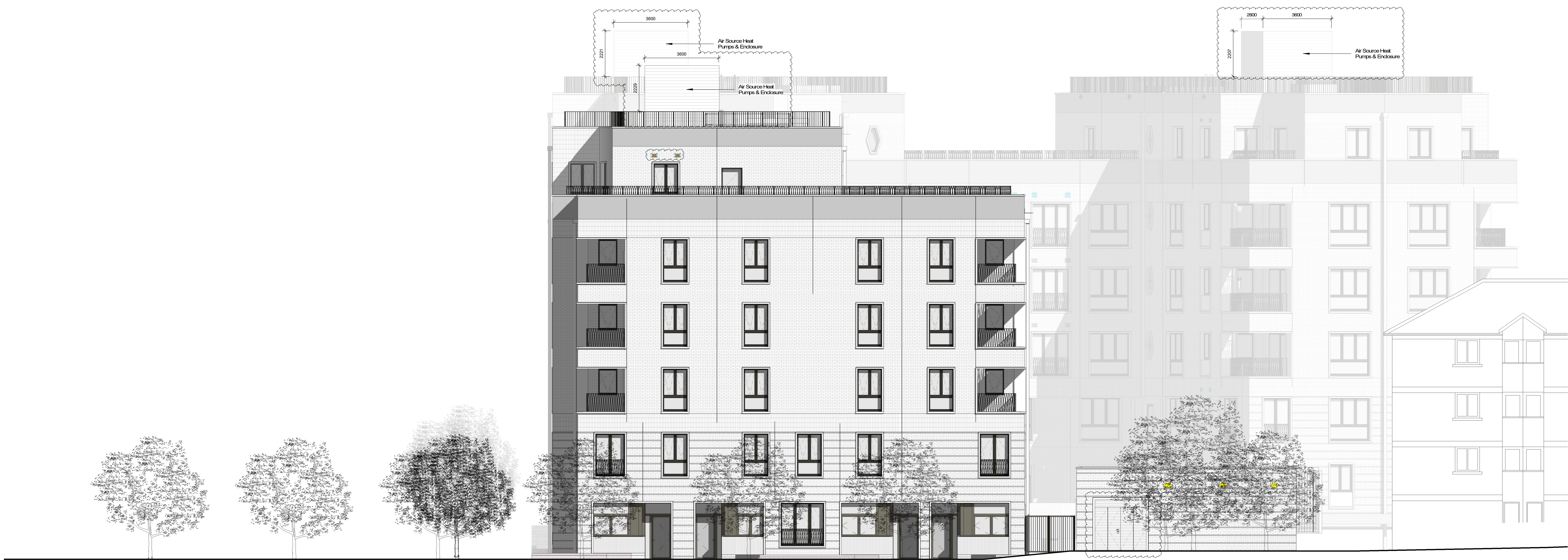
2 South Elevation - Planning 1:100