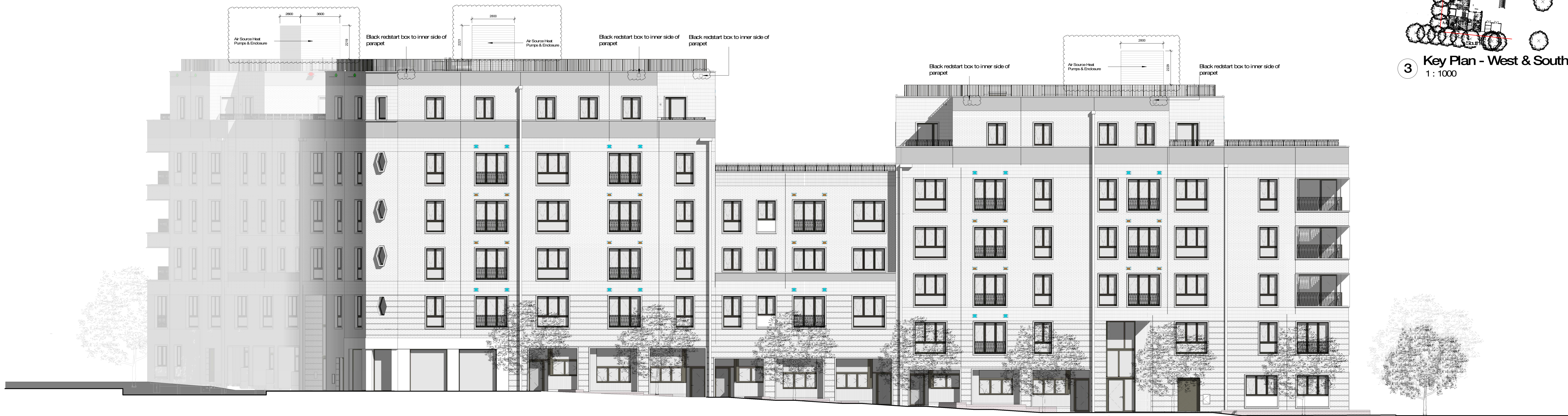
1 West Elevation - Planning 1:100