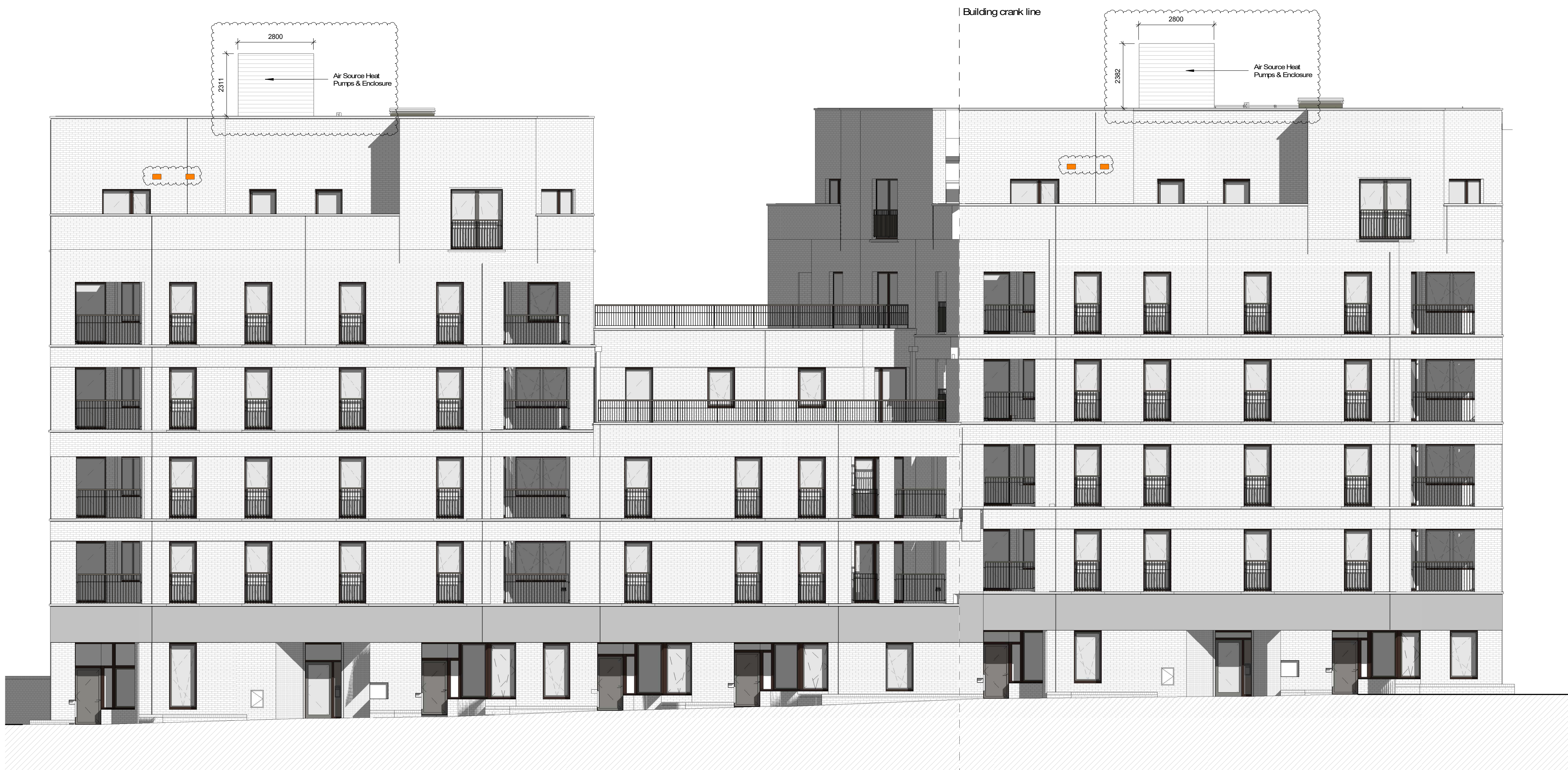
1 East Elevation - Planning 1 : 100