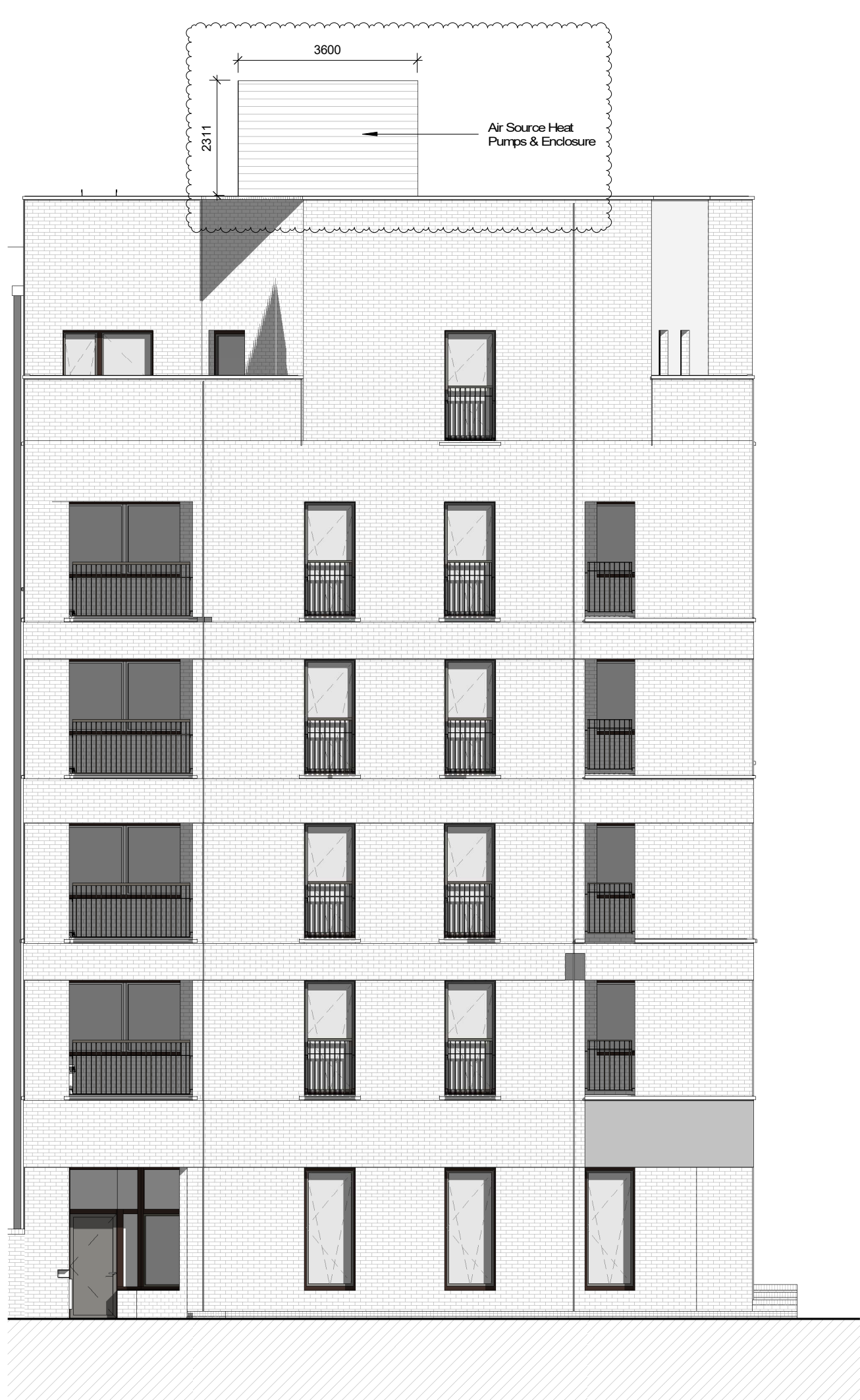
3 South Elevation - Planning 1 : 100