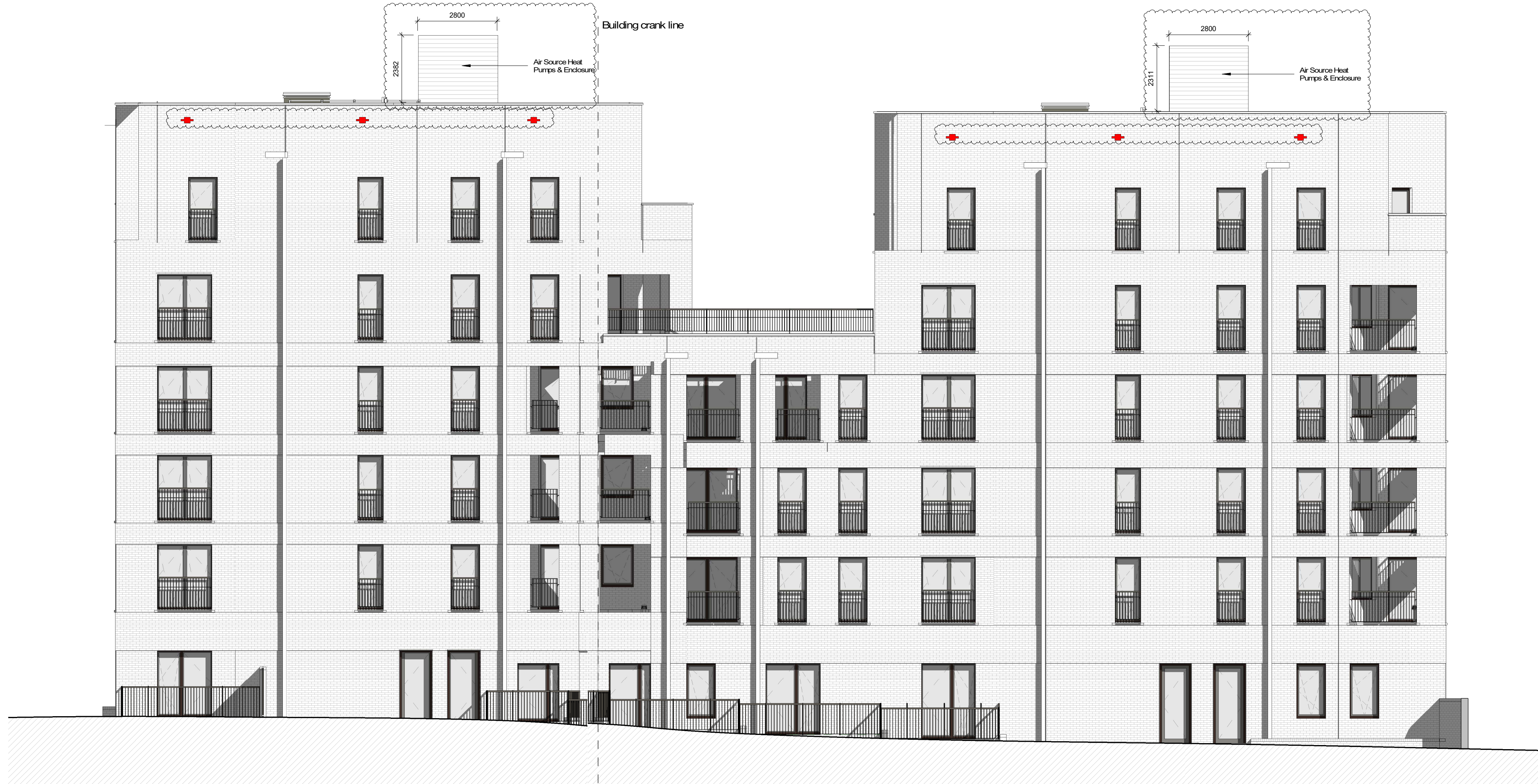
4 West Elevation - Planning 1 : 100

Gridline 11 is Gridline 11 on Structural engineers plans