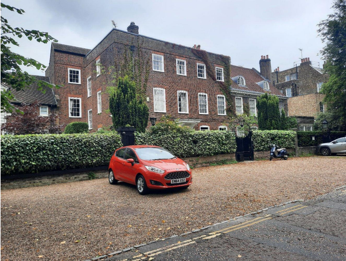
Front elevation including graveled parking area