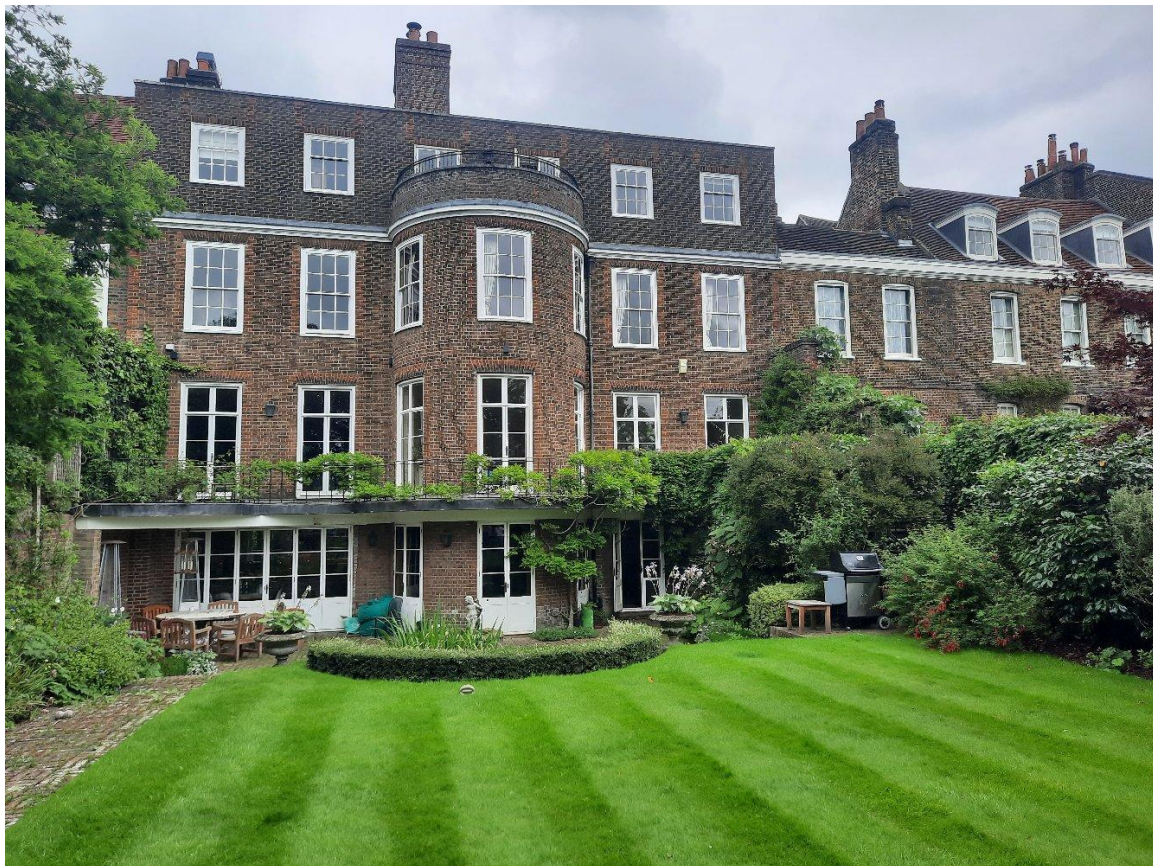
Rear elevation and view of part of upper part of garden