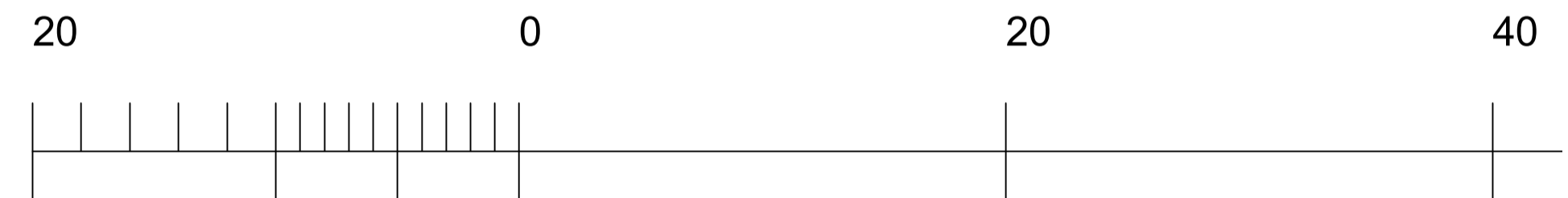
BLOCK PLAN | Scale 1:250 at A1