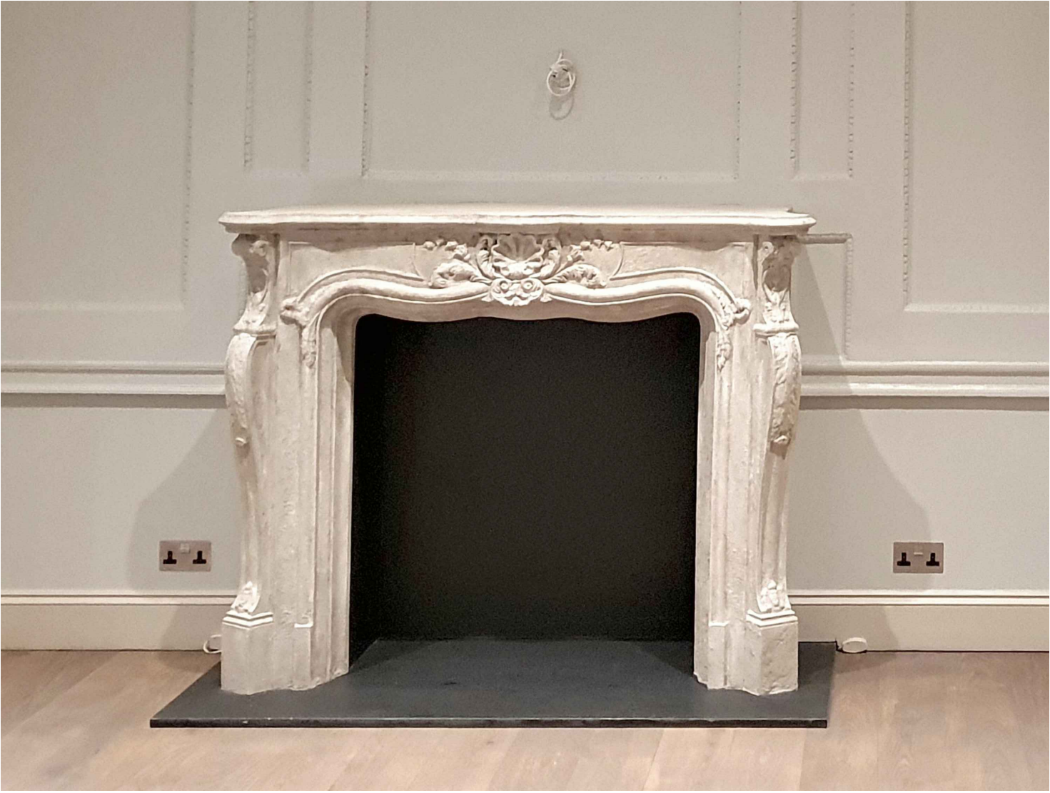
Photo of existing fireplace