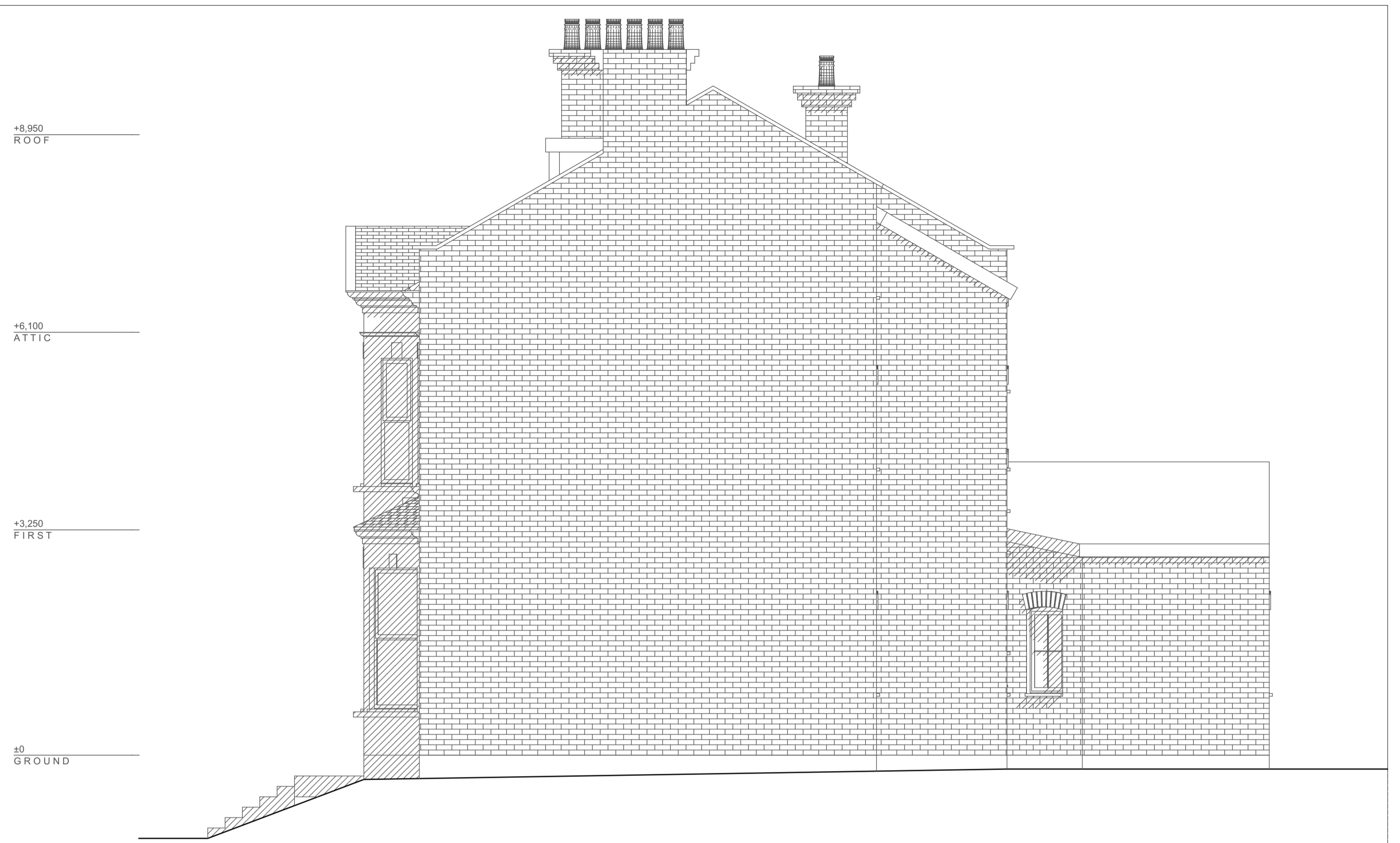
PROPOSED EAST ELEVATION 1:50