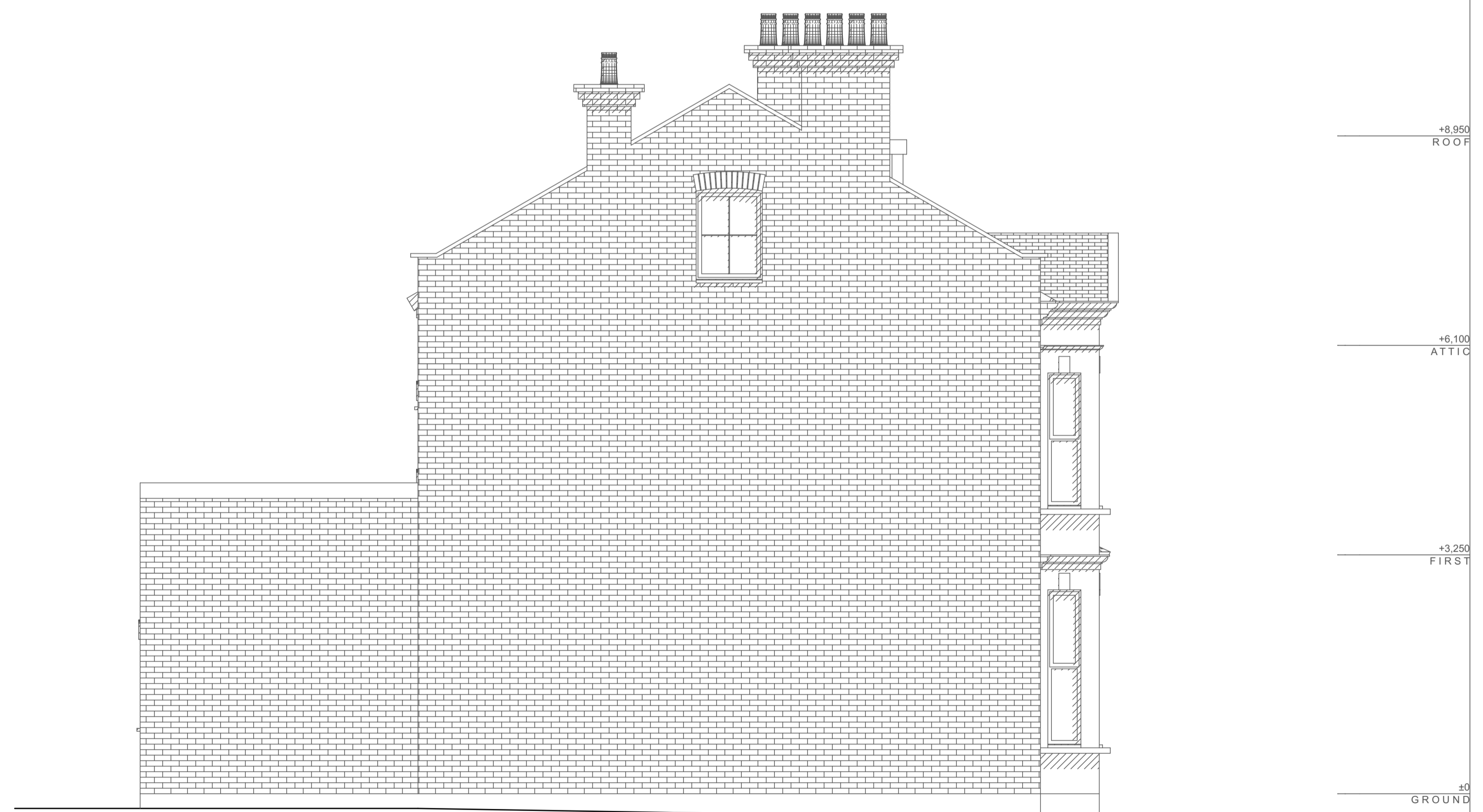
PROPOSED WEST ELEVATION 1:50