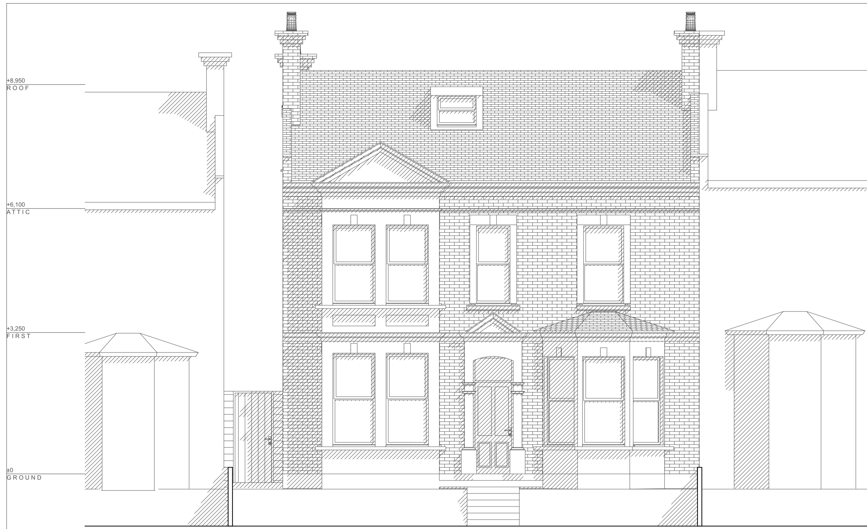
PROPOSED SOUTH ELEVATION 1:50