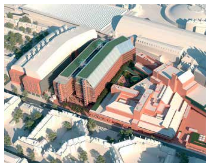
Revised design with linked linear buildings

The revised proposal presents a pair of linked linear buildings, separated by a glazed atrium that forms the roof and provides daylight to the new library foyer, illustrated below. The Proposed Development generally follows this form. However, to reduce daylight and sunlight impacts on residents along Ossulston Street, the western end of the building was shifted 18 metres to the east.