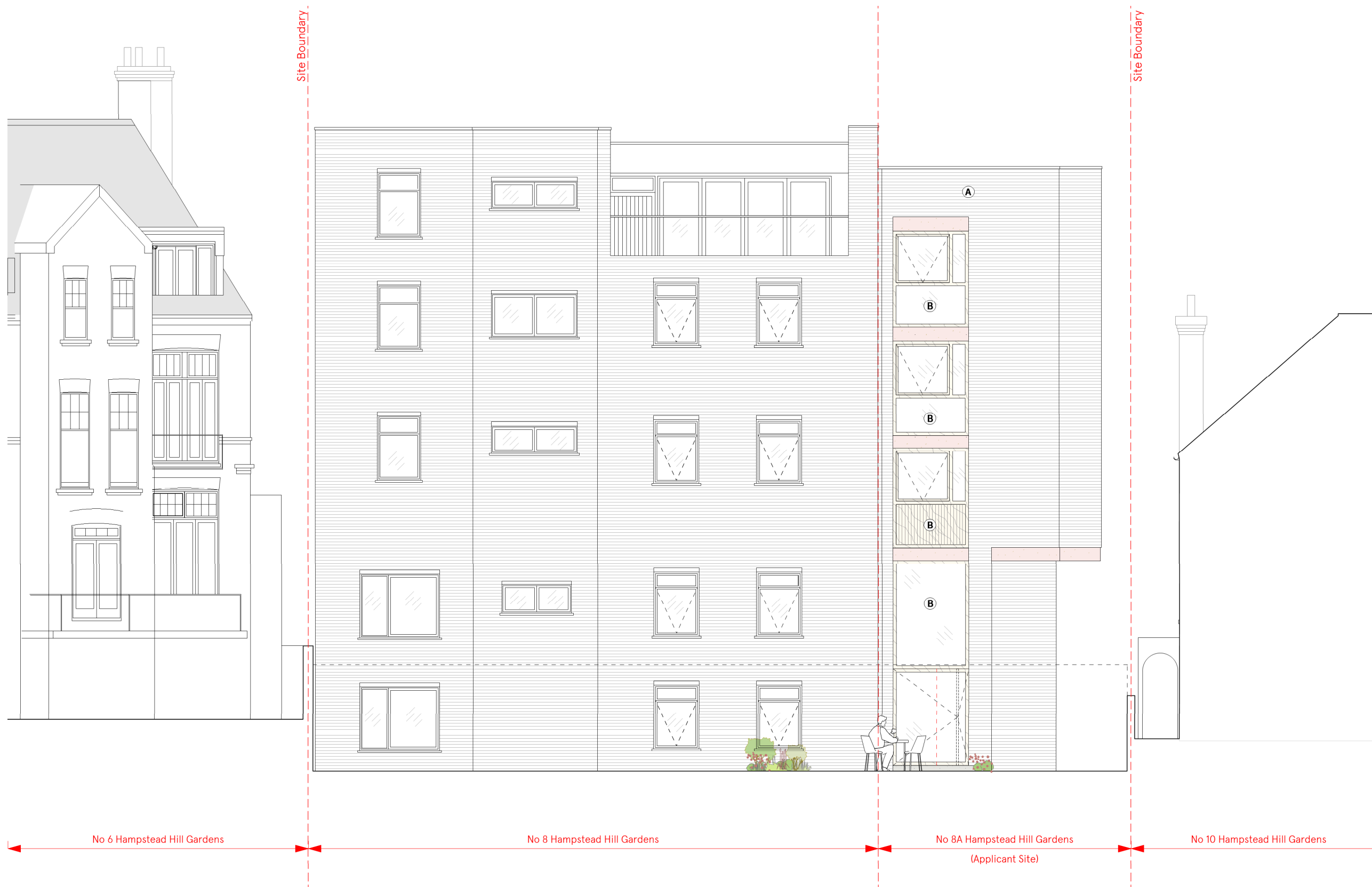
Elevation EE - Proposed Scale 1:100