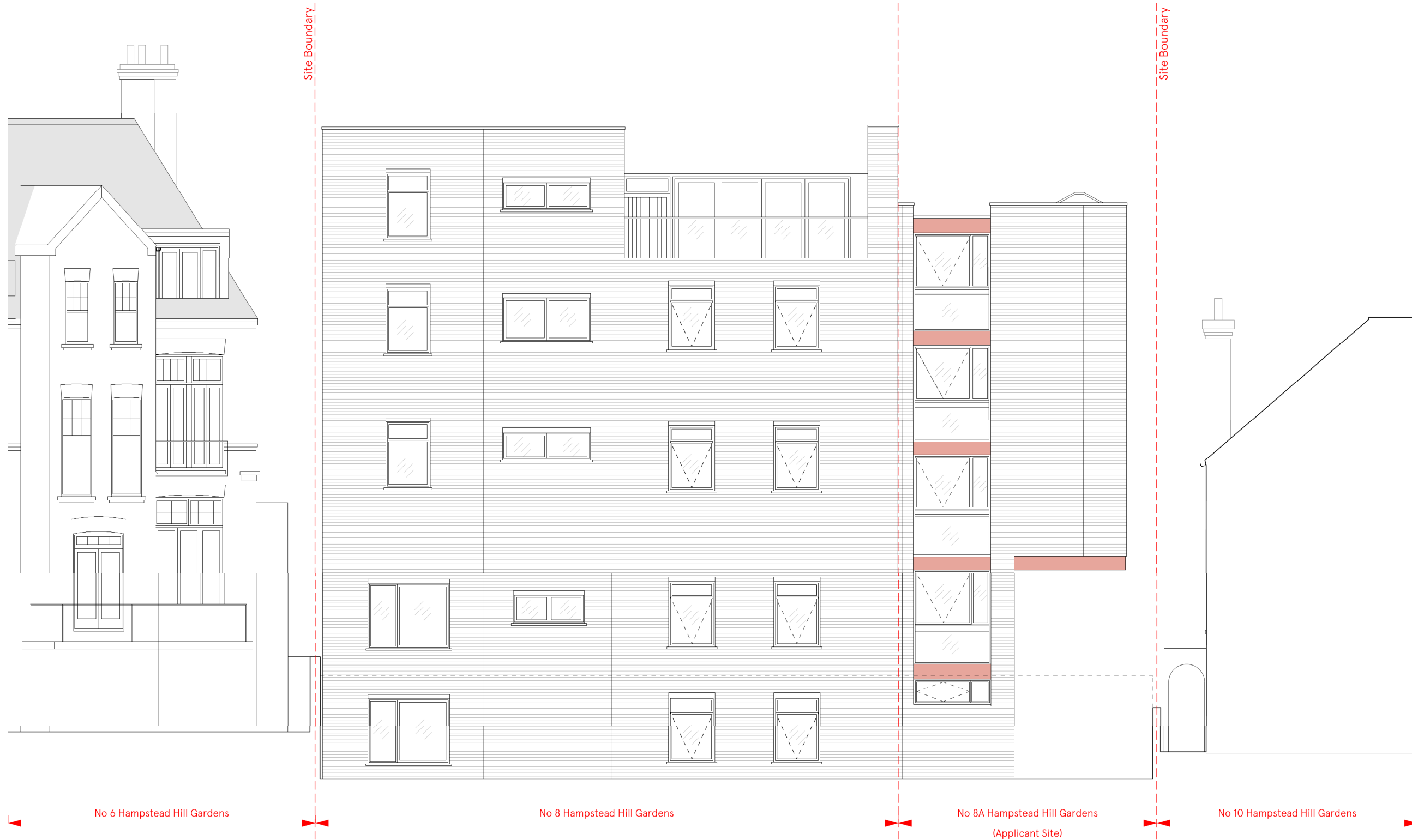
Elevation EE - Existing Scale 1:100