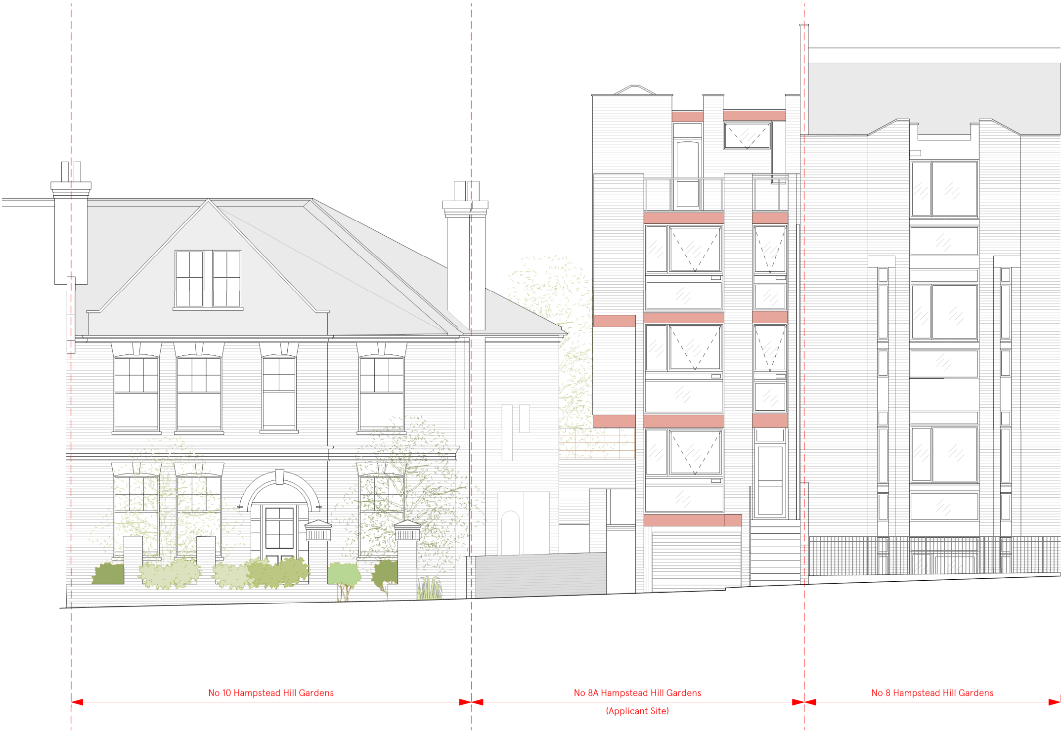
Elevation AA - Existing Scale 1:100