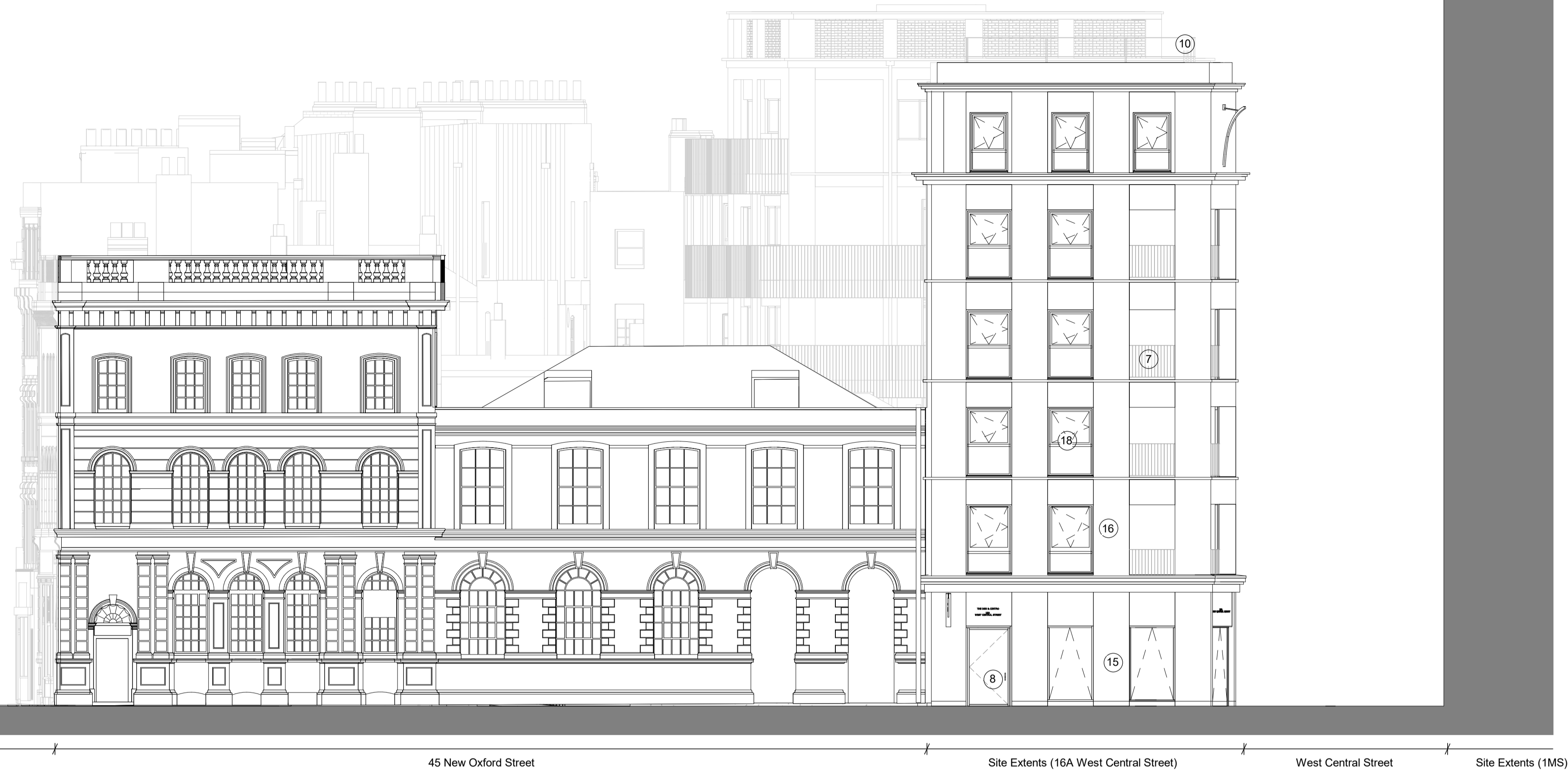
1 West Central Street - Proposed South West Elevation