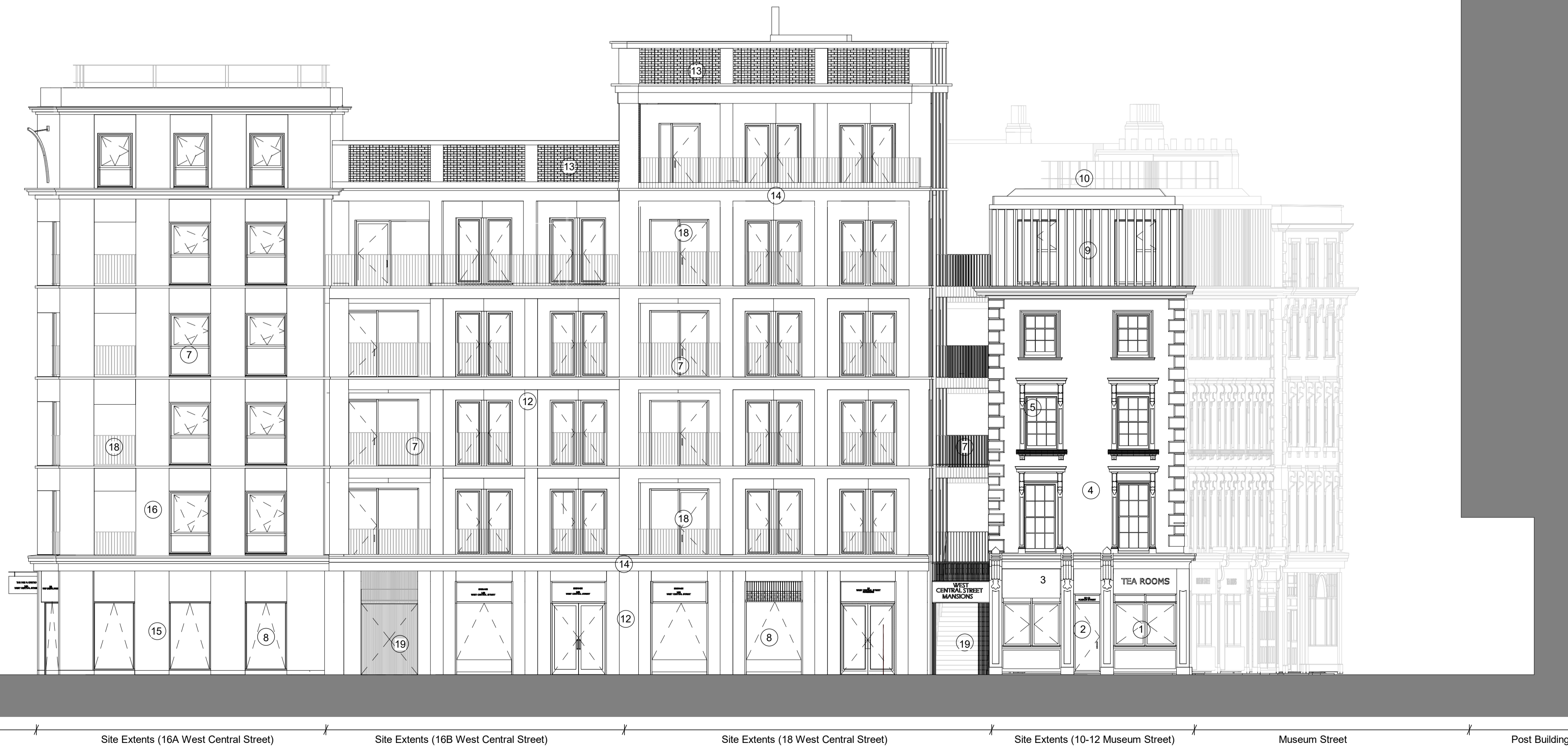
2 West Central Street - Proposed South East Elevation