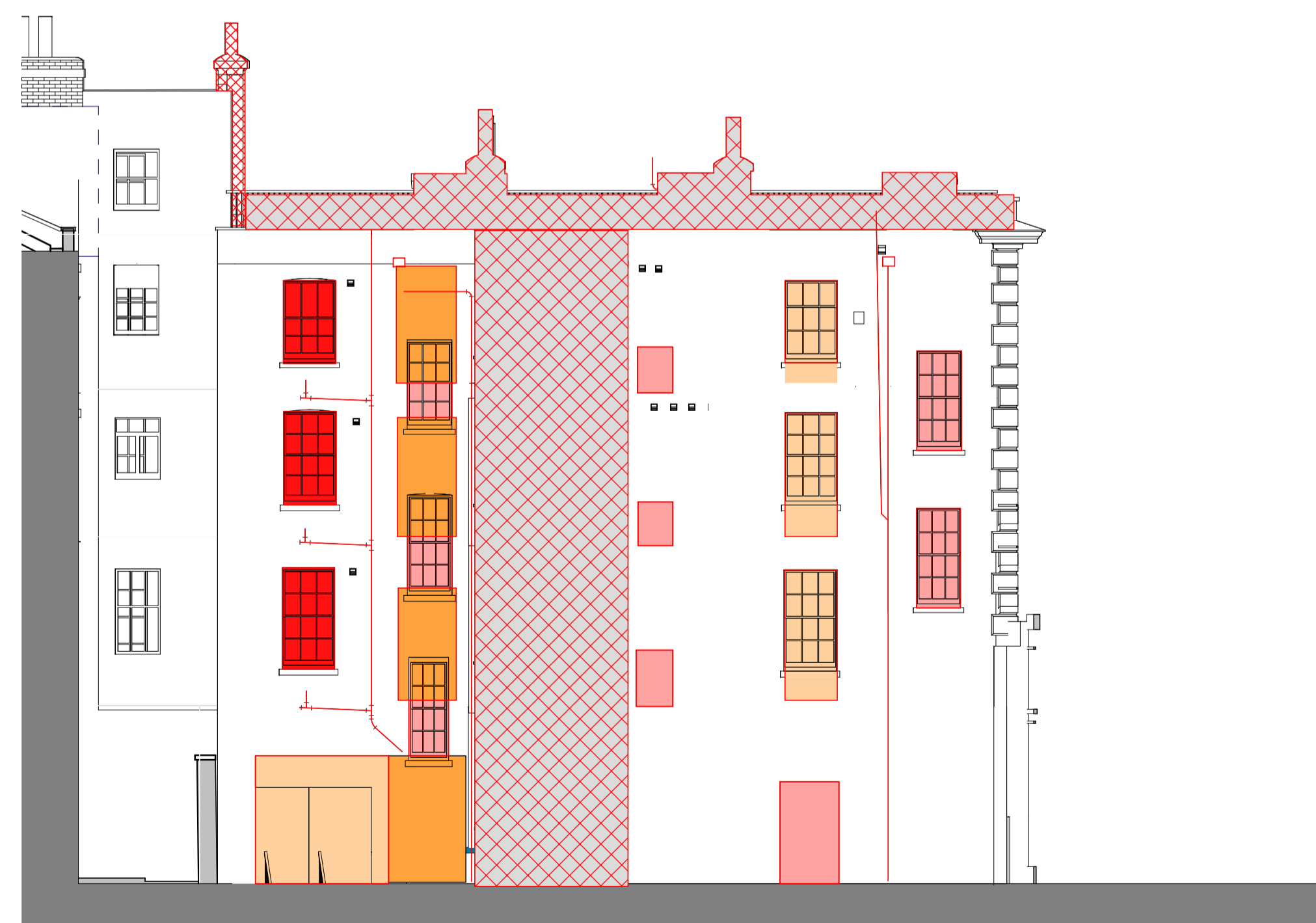
3 Courtyard West B - Proposed Demolition Elevation