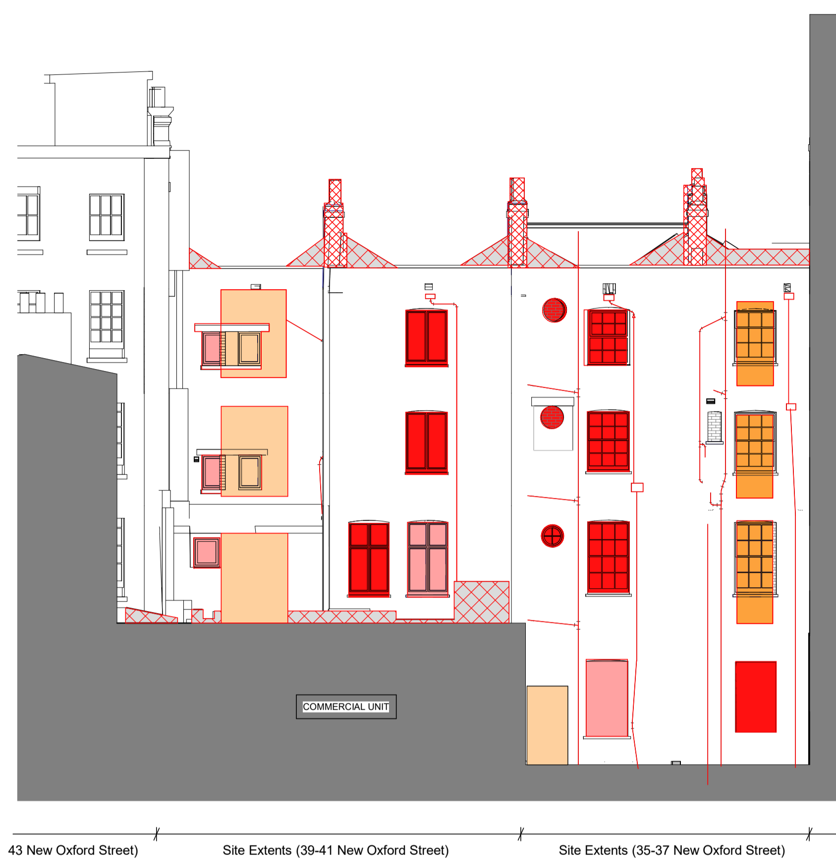
1 Courtyard South - Proposed Demolition Elevation

USE LATEST REVISION CHECK DIMENSIONS ON SITE