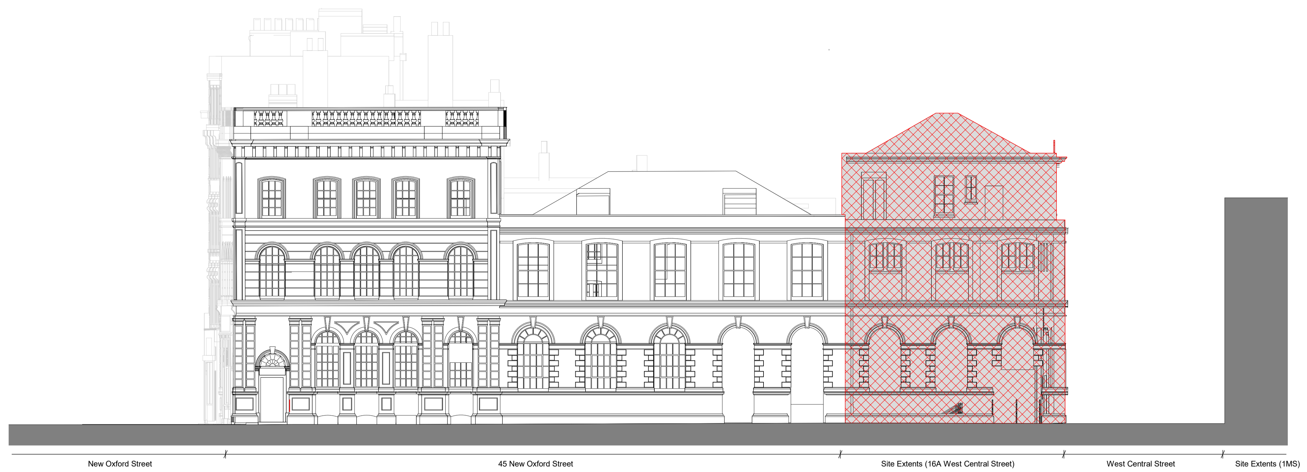
2 West Central Street - South West - Proposed Demolition Elevation

GENERAL NOTES: Existing drawings are for reference only - not for approval. Planning Boundary shown is intended to align with proposed West End Project front extents along High Holborn, and is based on available information as submitted.