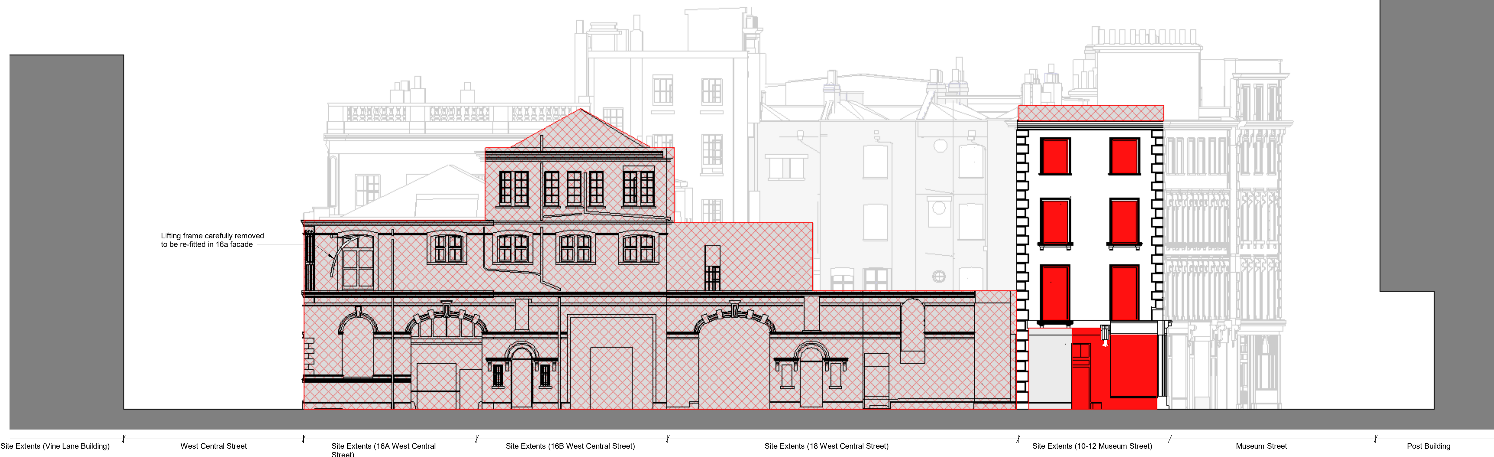
1 West Central Street - South East - Proposed Demolition Elevation

REPORT DISCREPANCIES DO NOT SCALE FROM THIS DRAWING COPYRIGHT DSDHA USE LATEST REVISION CHECK DIMENSIONS ON SITE