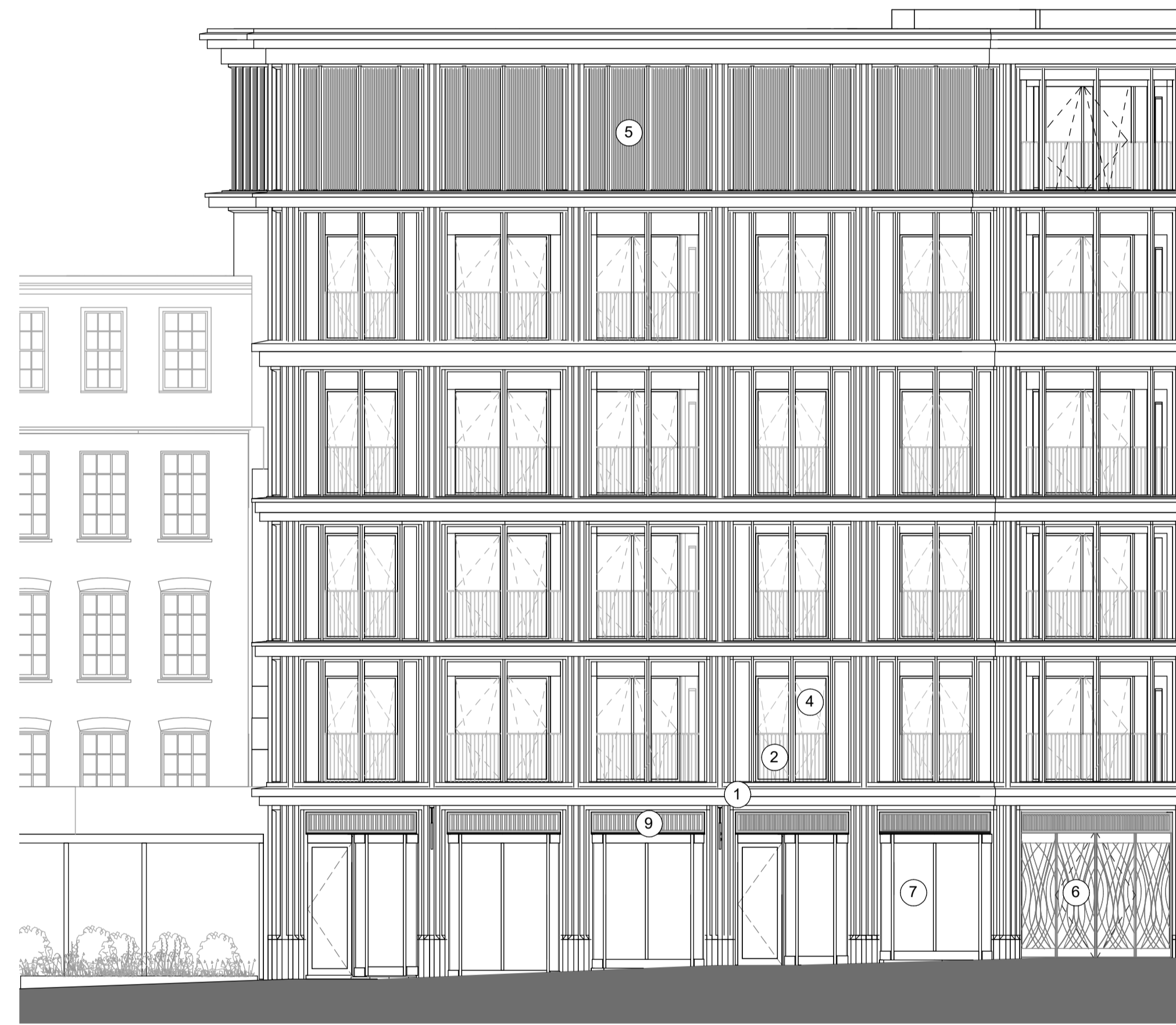
Pocket Garden Site Extents (Vine Lane Building)