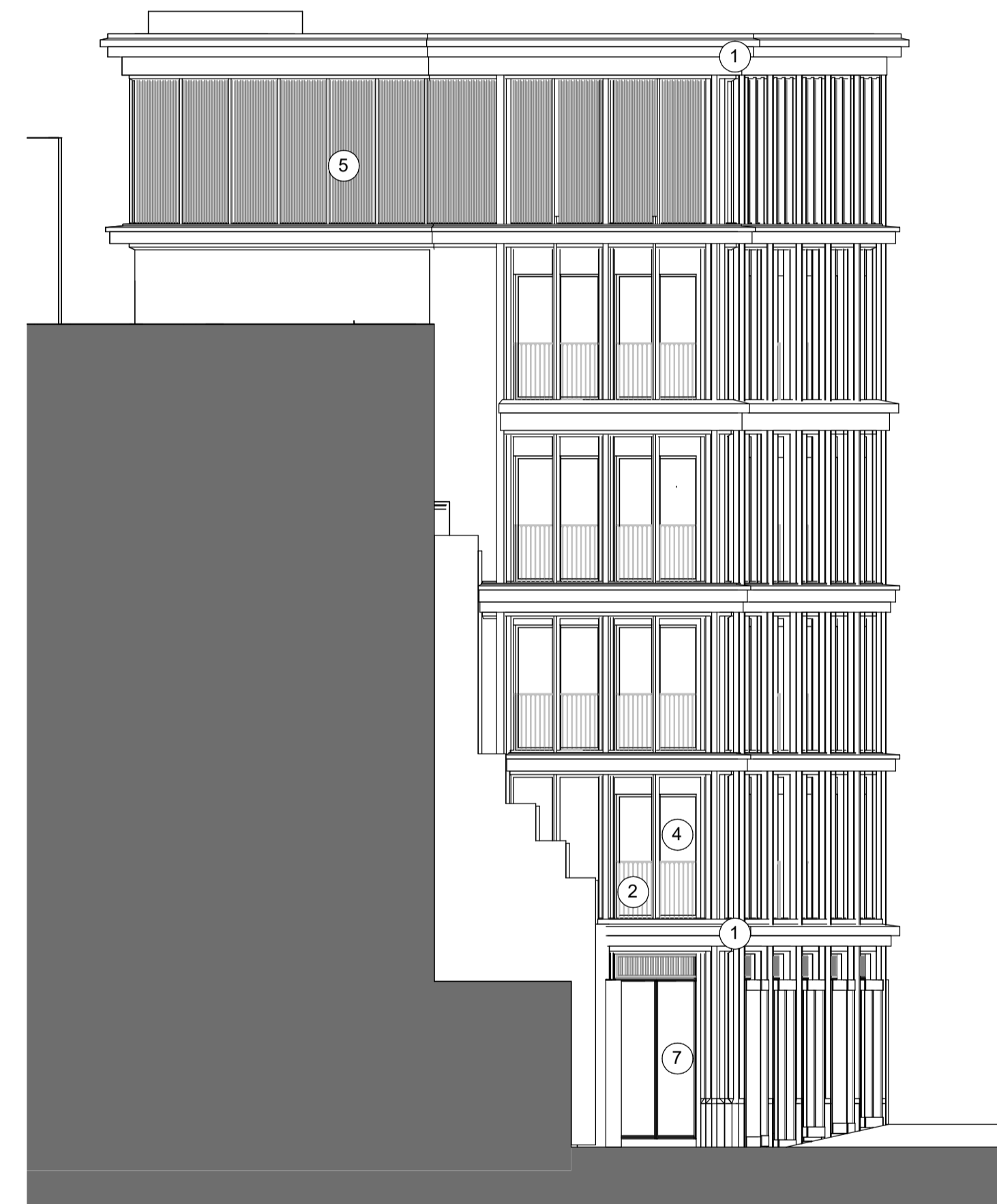
Existing Buildings Site Extents (Vine Lane Building) Vine Lane