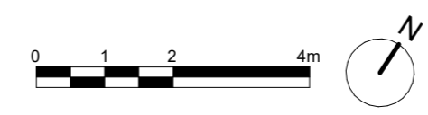
1 Vine Lane Building - Roof Plan 1 : 100

REPORT DISCREPANCIES DO NOT SCALE FROM THIS DRAWING COPYRIGHT DSDHA USE LATEST REVISION CHECK DIMENSIONS ON SITE