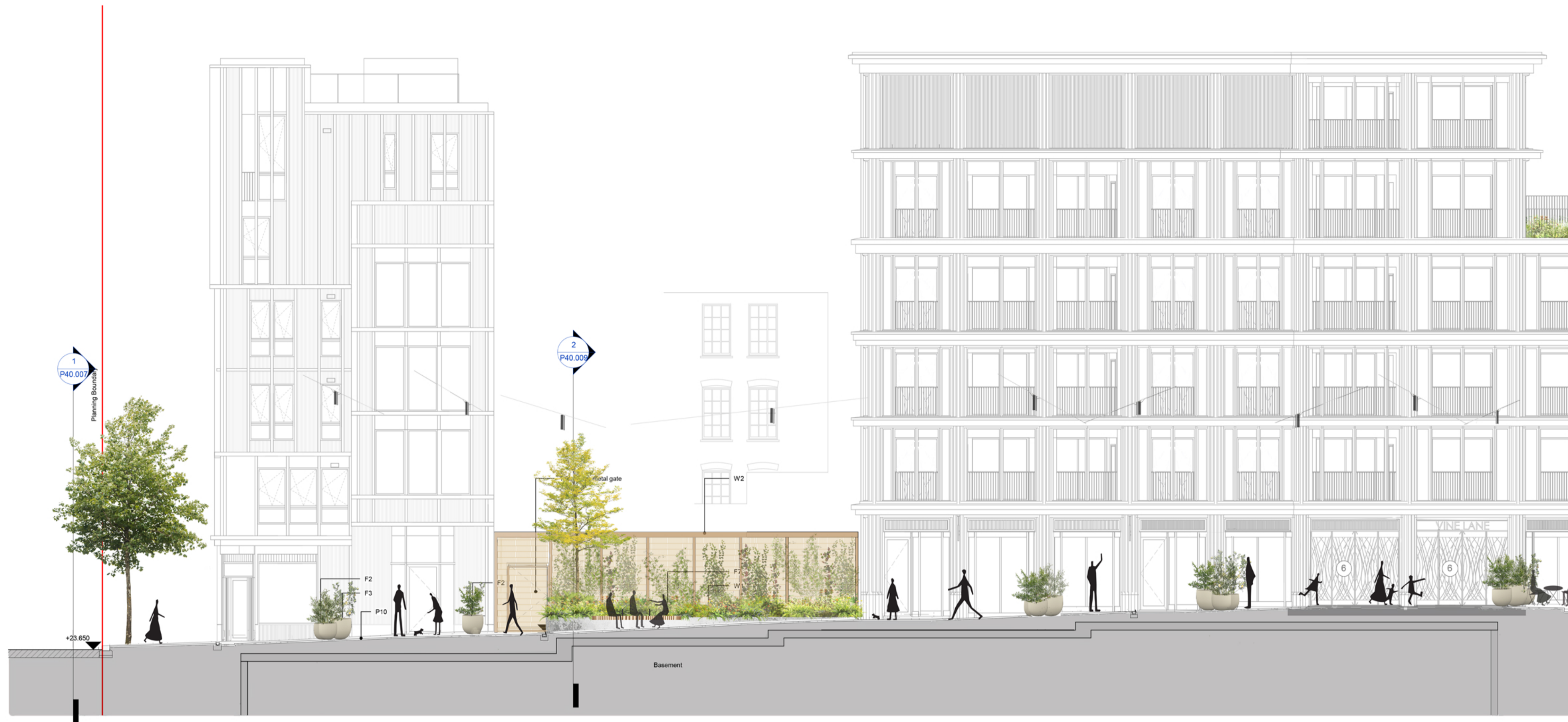
1 Public Realm - Proposed Site Section CC 1: 100