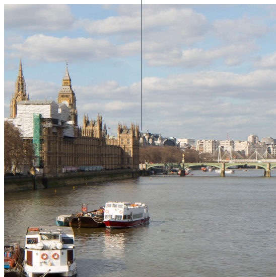
1 Museum Street