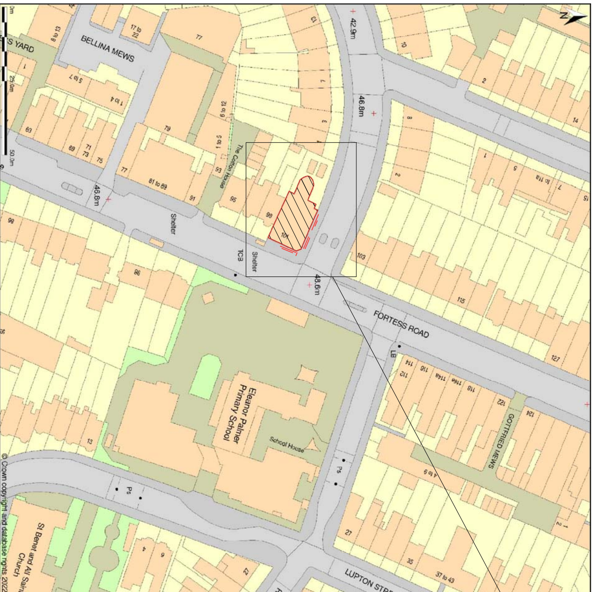
Plan View Scale 1:1250