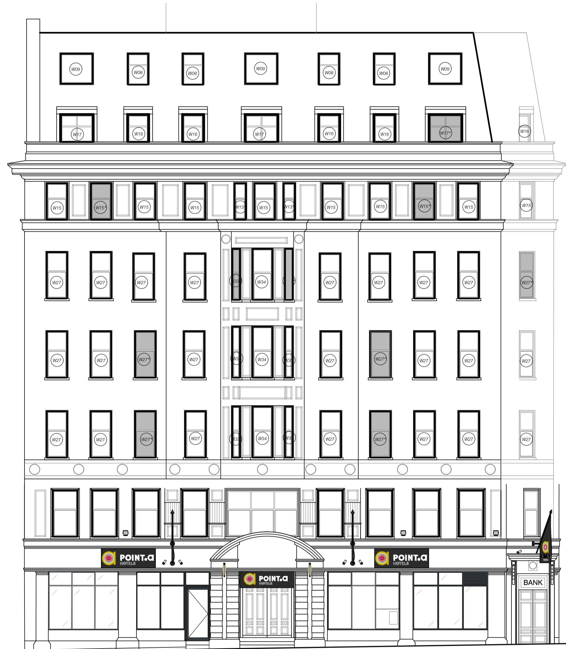
FRONT ELEVATION (A) Scale 1:100