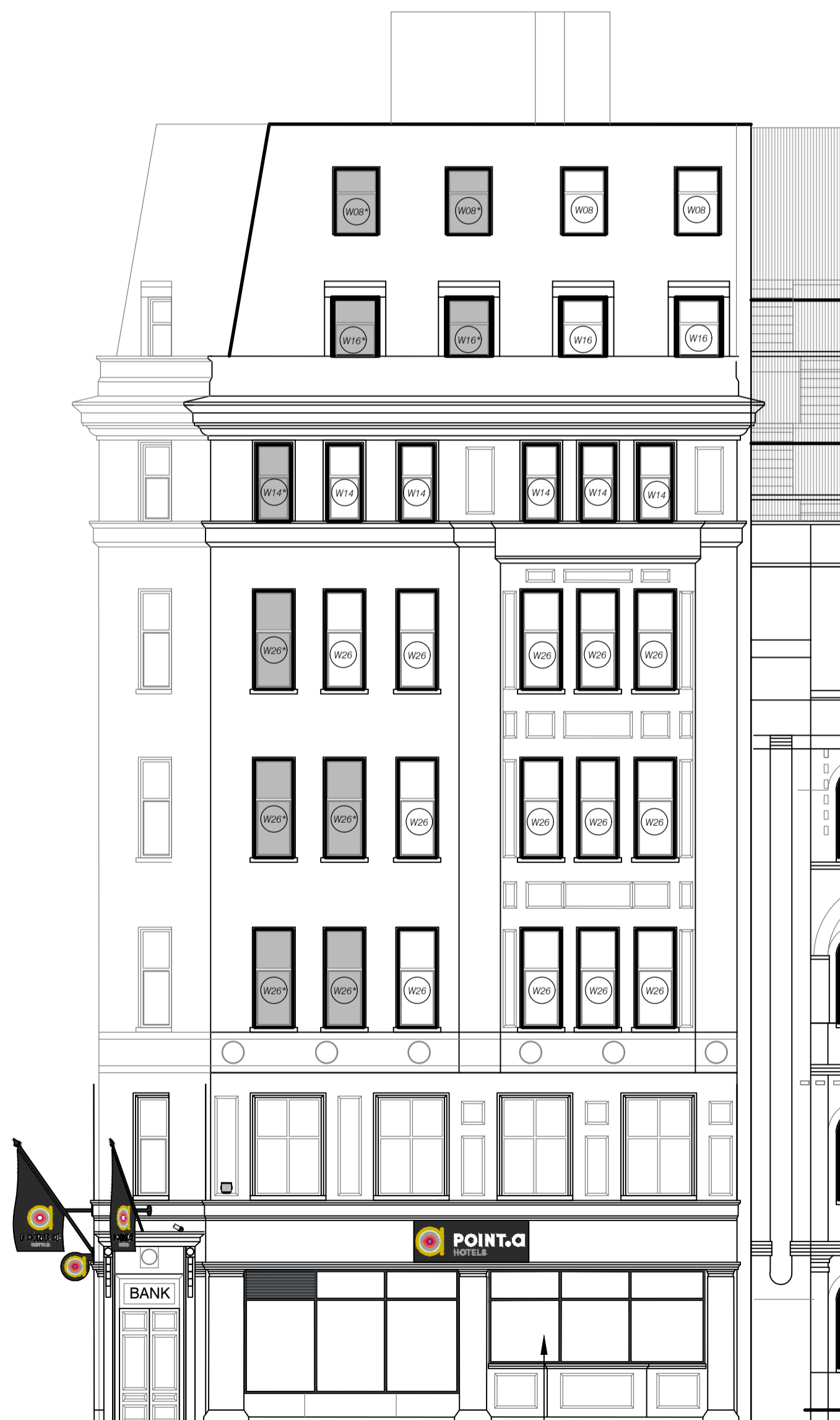
FRONT ELEVATION (B)

New PPC aluminium framed windows in existing opening. Windows to match existing adjacent grey windows