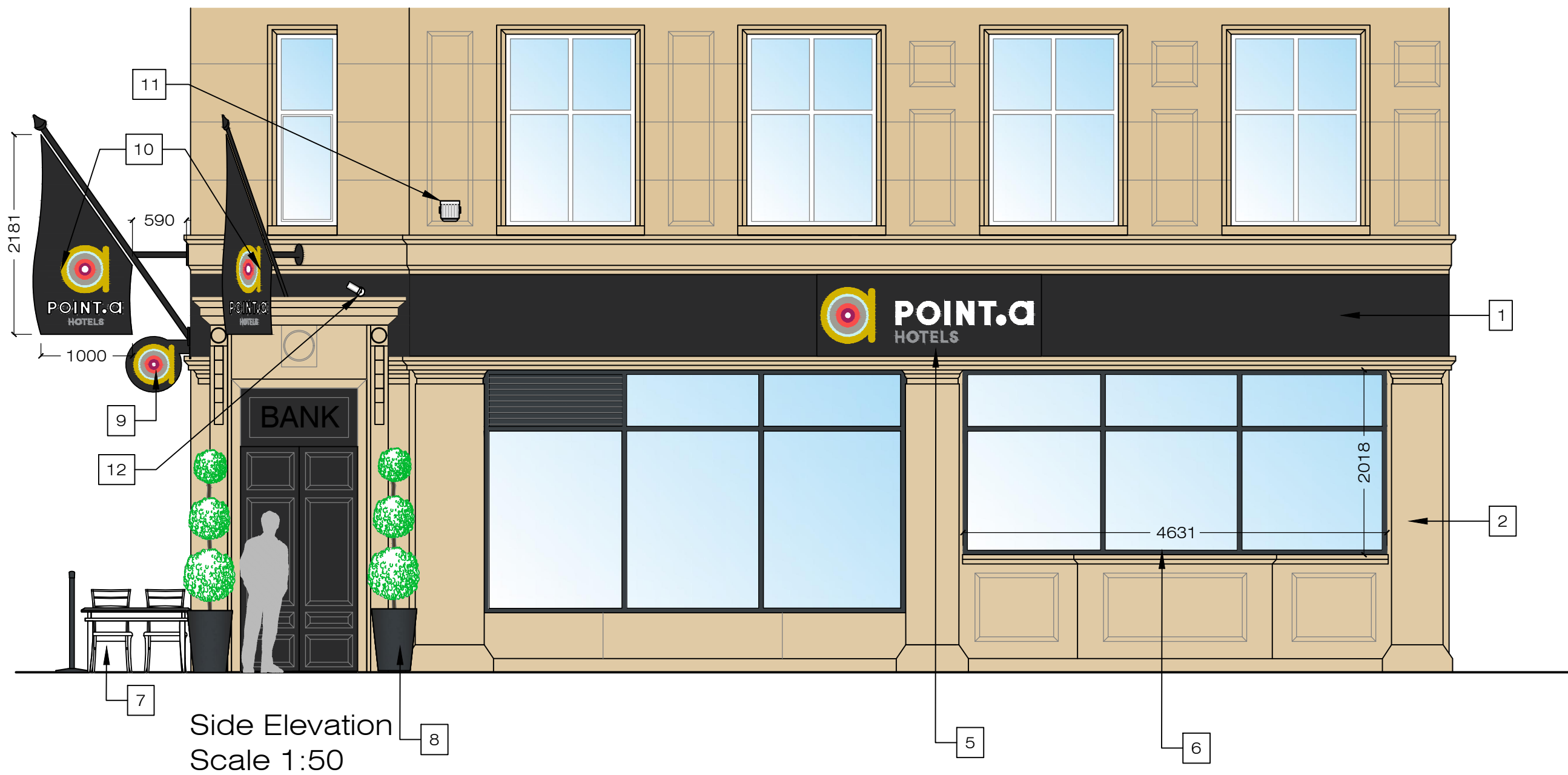
Side Elevation Scale 1:50