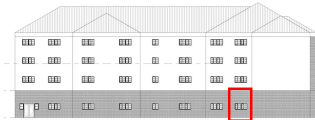
WEST ELEVATION EXISTING