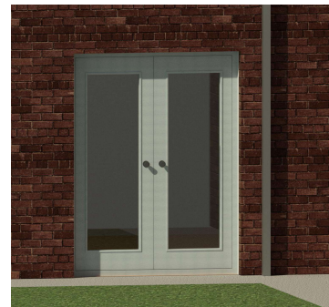
PROPOSED TIMBER FRAME GLAZED DOOR