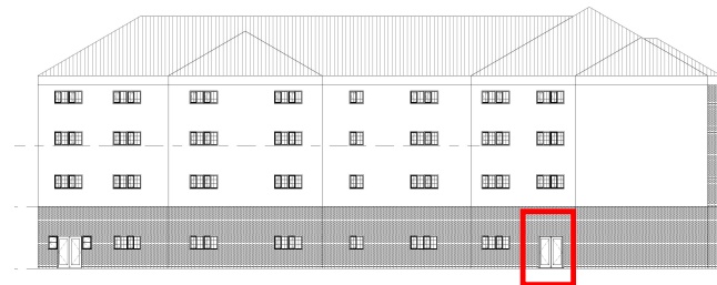
WEST ELEVATION PROPOSED