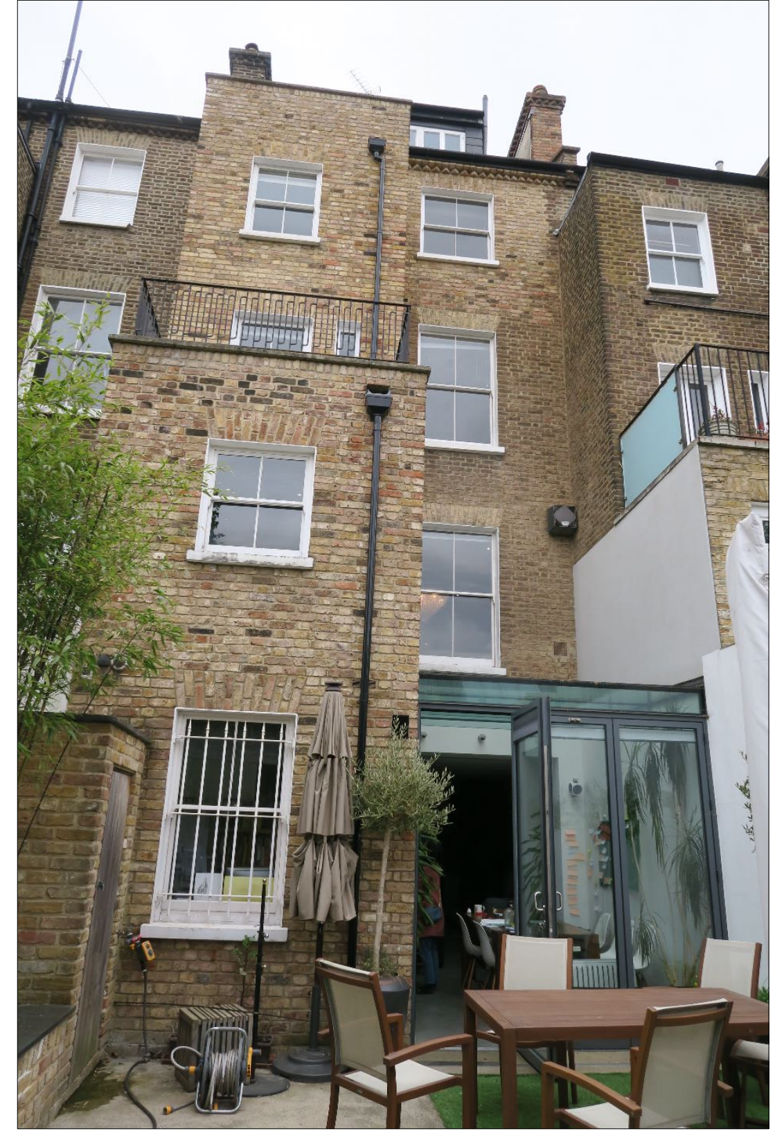
1. rear view of property

date notes dimensions are not to be scaled from this drawing. this drawing is based on current available information and should not be relied on as accurate measurements of usable space, the contractor is responsible for checking all dimensions on site. this drawing is property of A2studio ltd. and copyright is reserved by them, the drawing is issued on condition that it is not copied or disclosed by or to any unauthorised persons without the prior consent in writing of A2studio ltd.