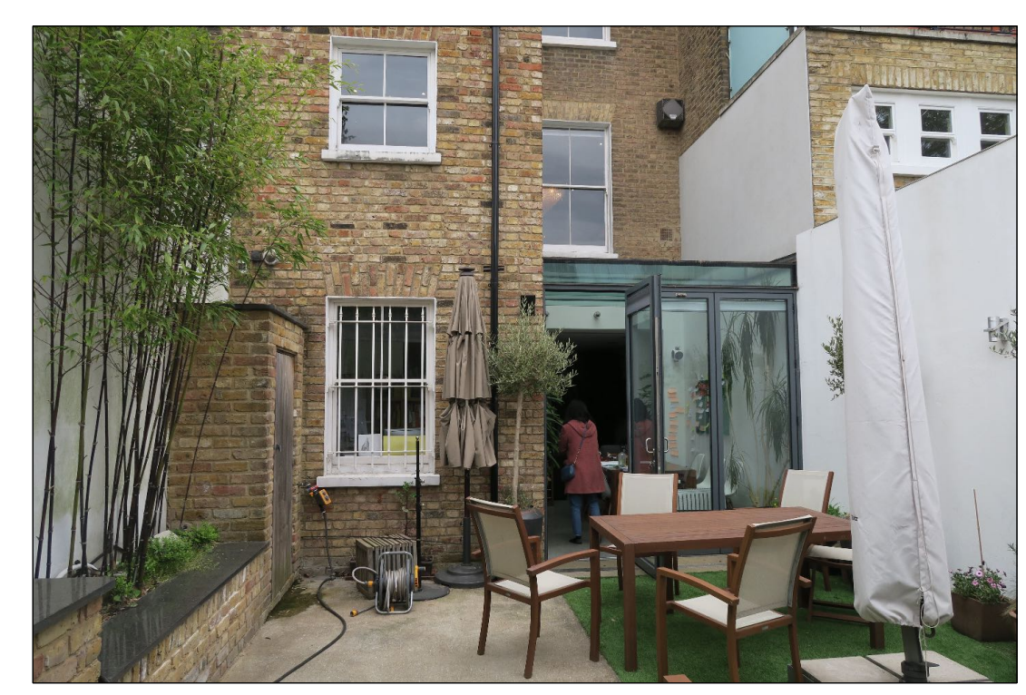
3. close up of window to be repalced