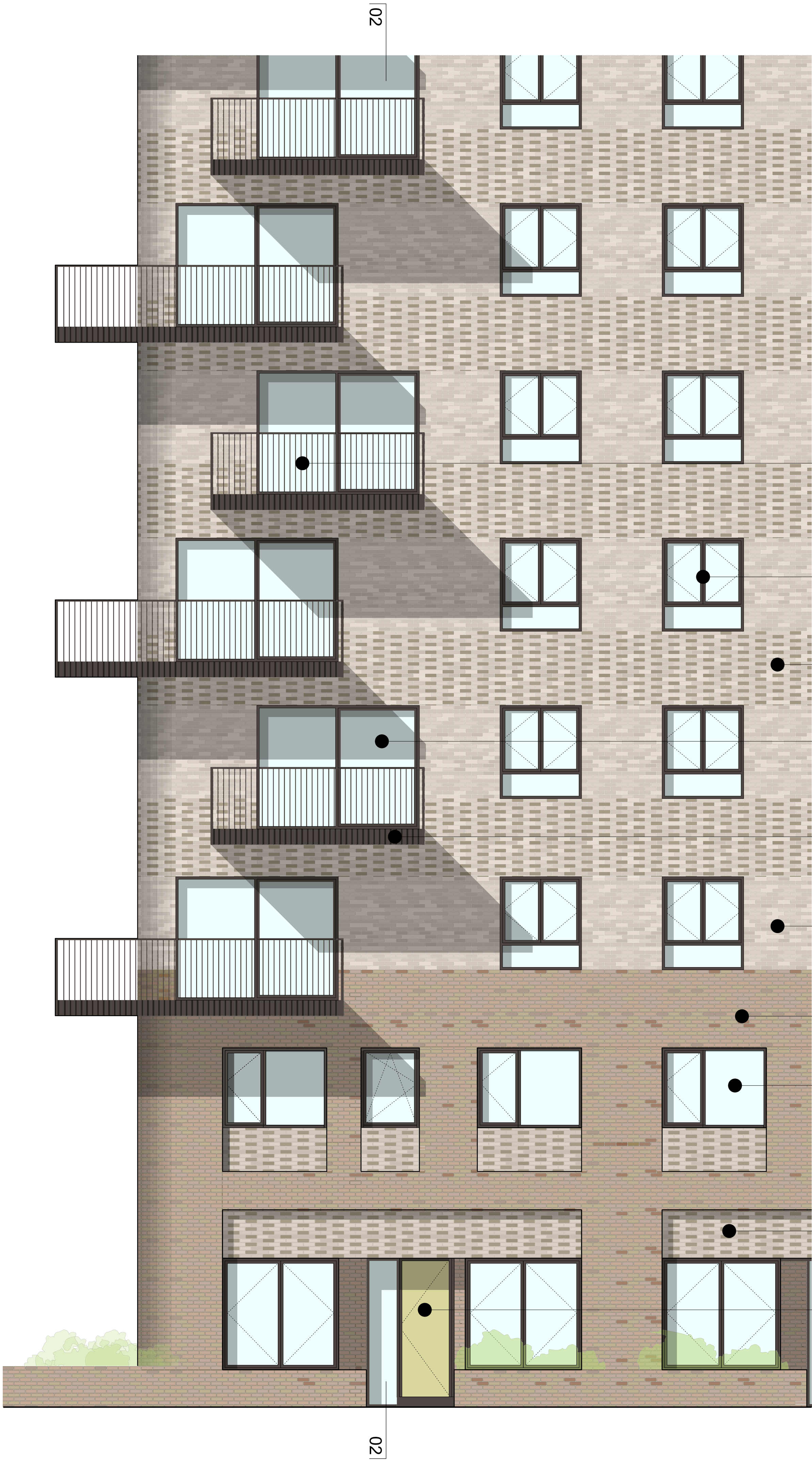
01 N4: SOUTH ELEVATION