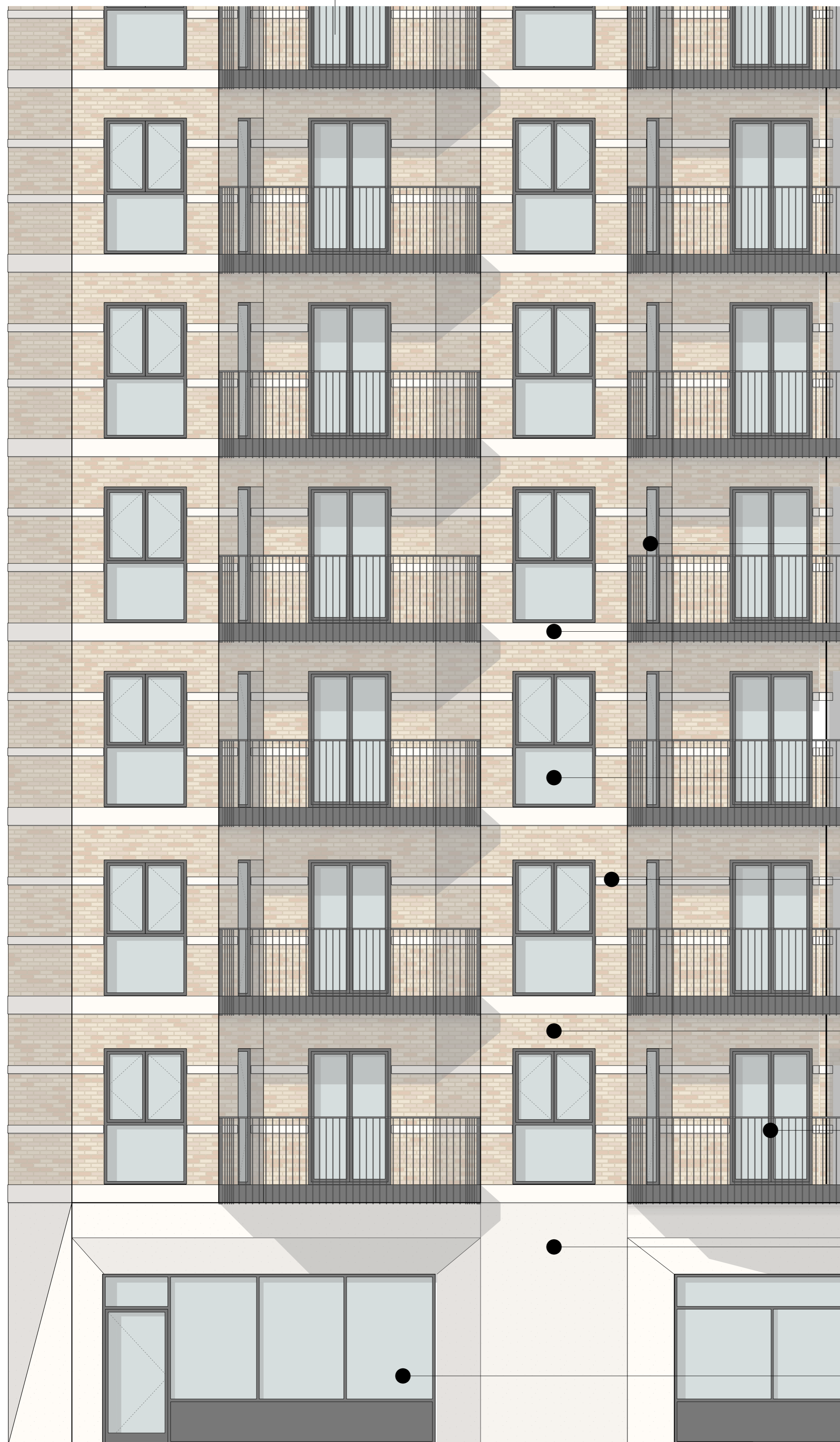
01 N3E: SOUTH ELEVATION