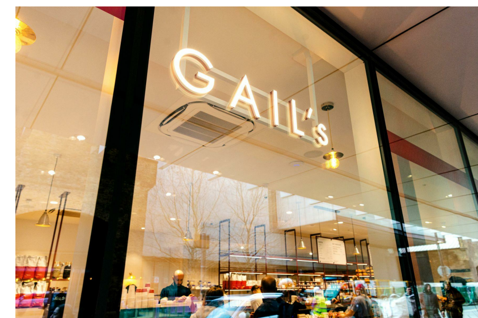
REFERENCE IMAGE 2 SUSPENDED GAIL'S SIGN INSIDE OF SHOPFRONT 150mm RED DECAL STRIP TO INSIDE OF SHOPFRONT COLOUR: RAL 3031 ORIENT RED FONT: FUTURA 300mm