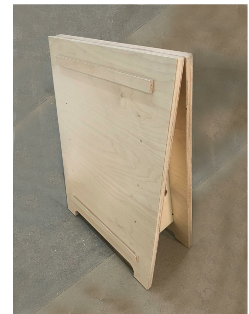
REFERENCE IMAGE 1 GAIL'S A-BOARD SIGN MARINE PLY - NATURAL TO RECEIVE A2 SIZE SPECIALS