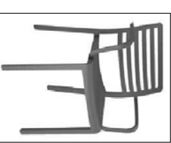
BENTLEY ARM CHAIR