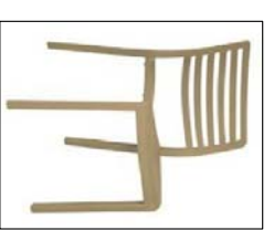
BENTLEY SIDE CHAIR