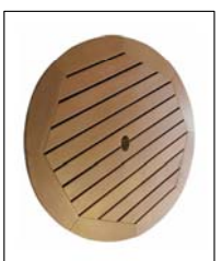
MONACO TABLE TOP