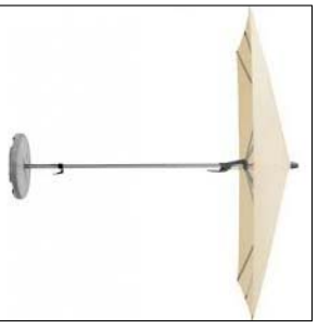
GLATZ FORTINO® GIANT UMBRELLAS, ALUMINIUM FRAME.