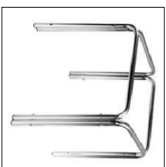
POLISHED ALUMINIUM STACKING BASE

UMBRELLA AND BASE TO BE USED FOR EACH TABLE.