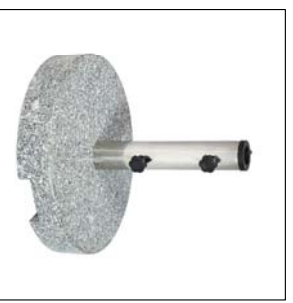
GRANITE UMBRELLA BASE, ROUND, 25KG UMBRELLA BASES BAG025S