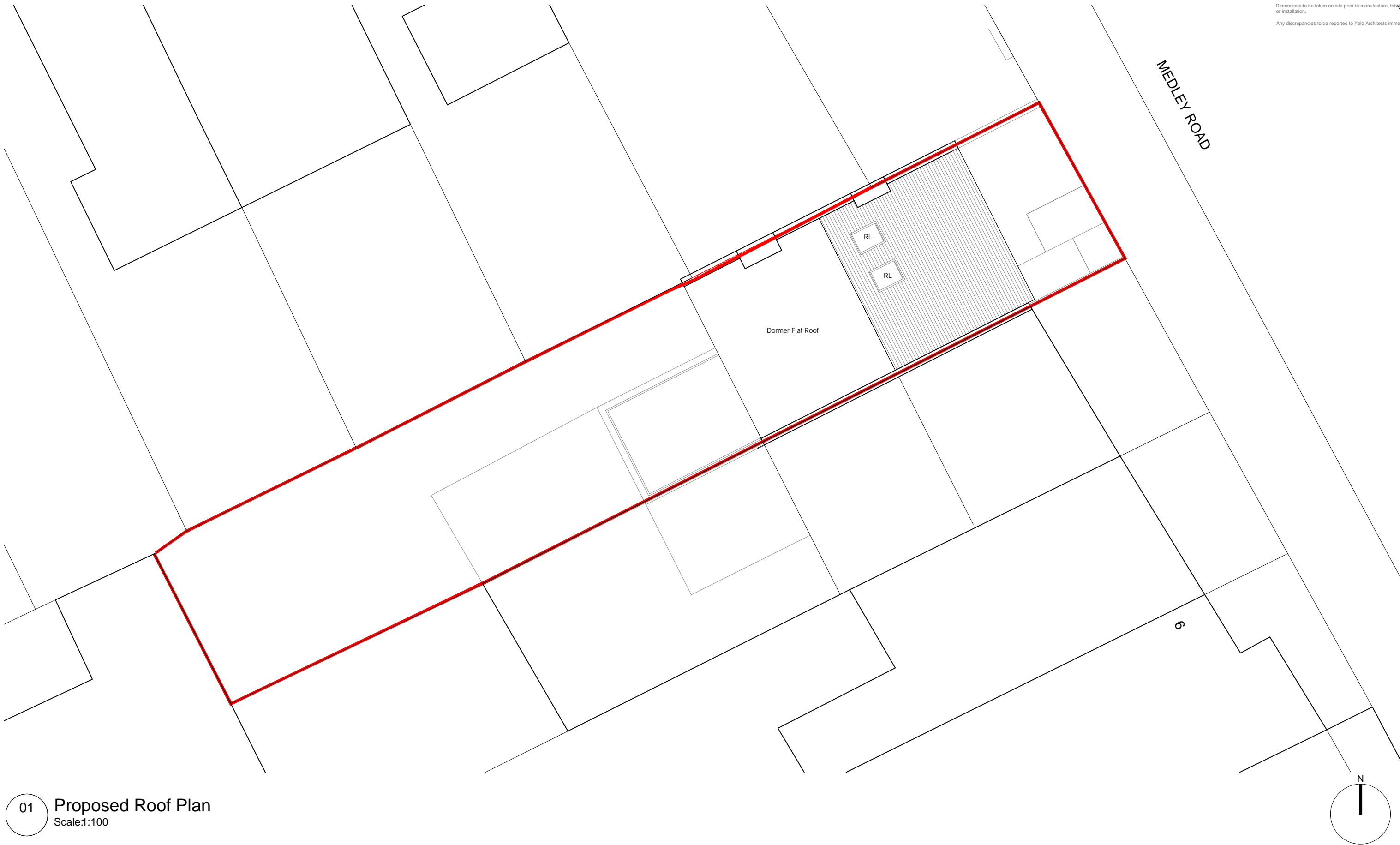
01 Proposed Roof Plan Scale:1:100

Do not scale from this drawing. Work to figured dimensions only. Dimensions to be taken on site prior to manufacture, fabrication or installation. Any discrepancies to be reported to Yelo Architects immediately.