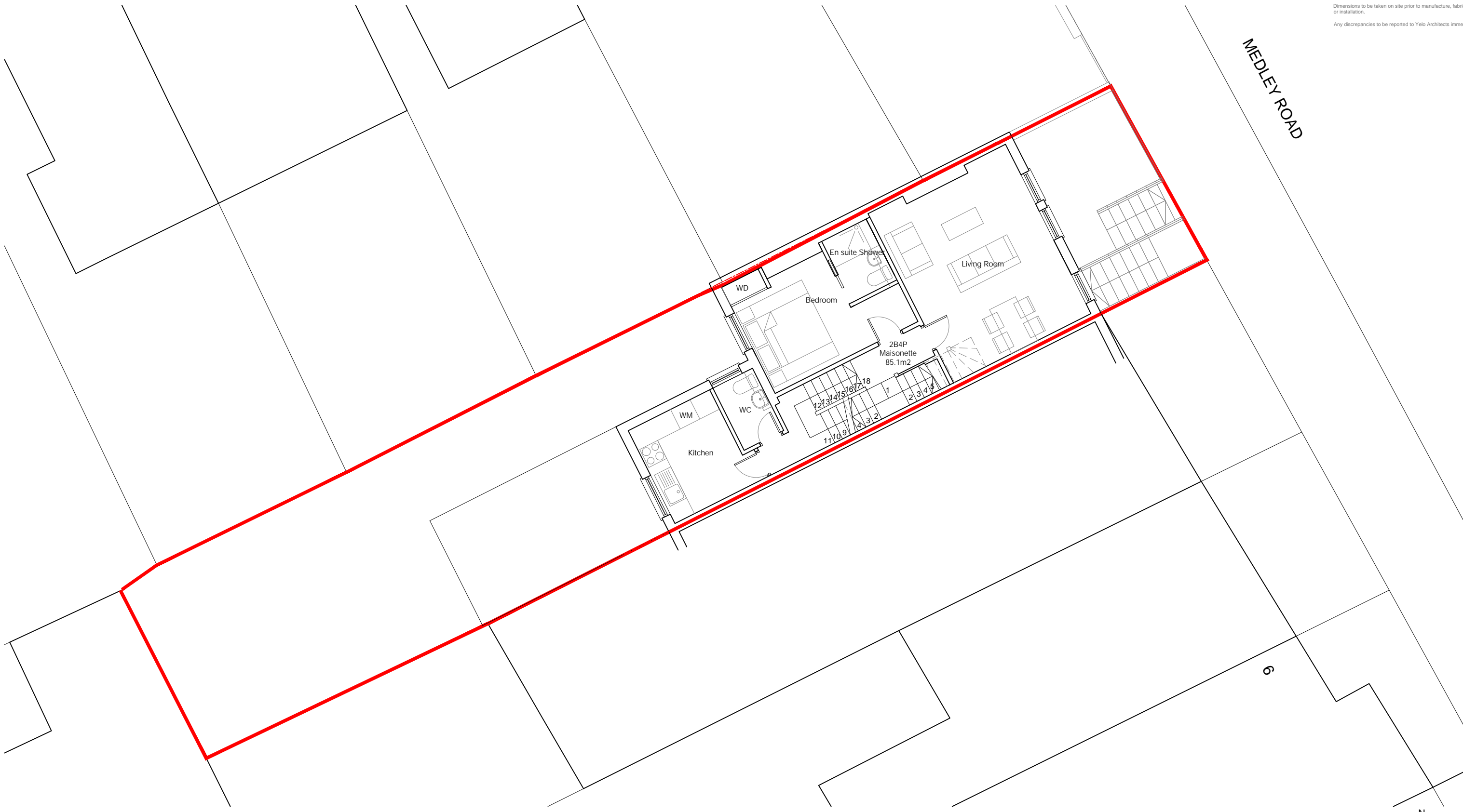
01 Proposed First Floor Plan Scale:1:100

Do not scale from this drawing. Work to figured dimensions only. Dimensions to be taken on site prior to manufacture, fabrication or installation. Any discrepancies to be reported to Yelo Architects immediately.