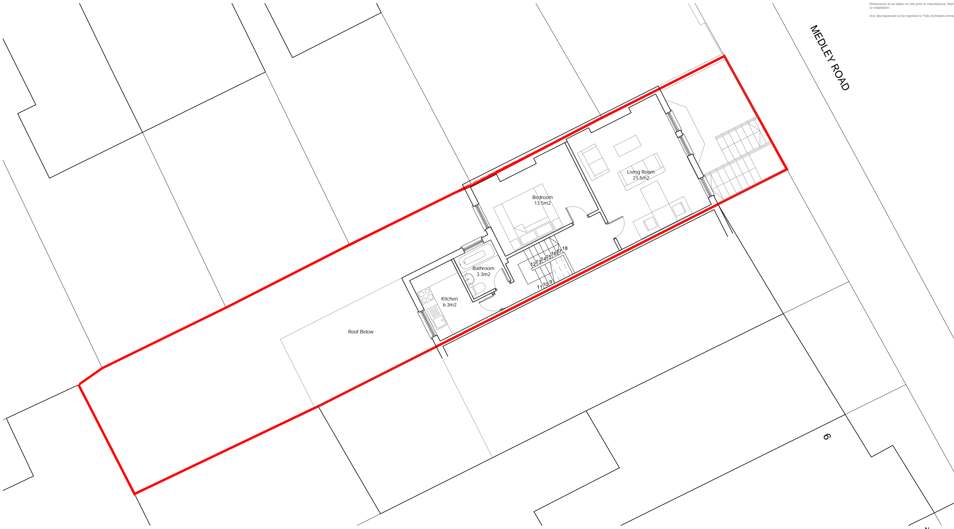
01 Existing First Floor Plan Scale:1:100

Do not scale from this drawing. Work to figured dimensions only. Dimensions to be taken on site prior to manufacture, fabrication or installation. Any discrepancies to be reported to Yelo Architects immediately.