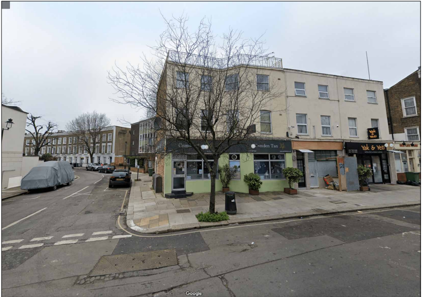
PH1 - View from Castelhaven Road