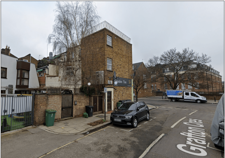
PH2 - View from Grafton Crescent

119B Castlehaven Road & metal roof railings