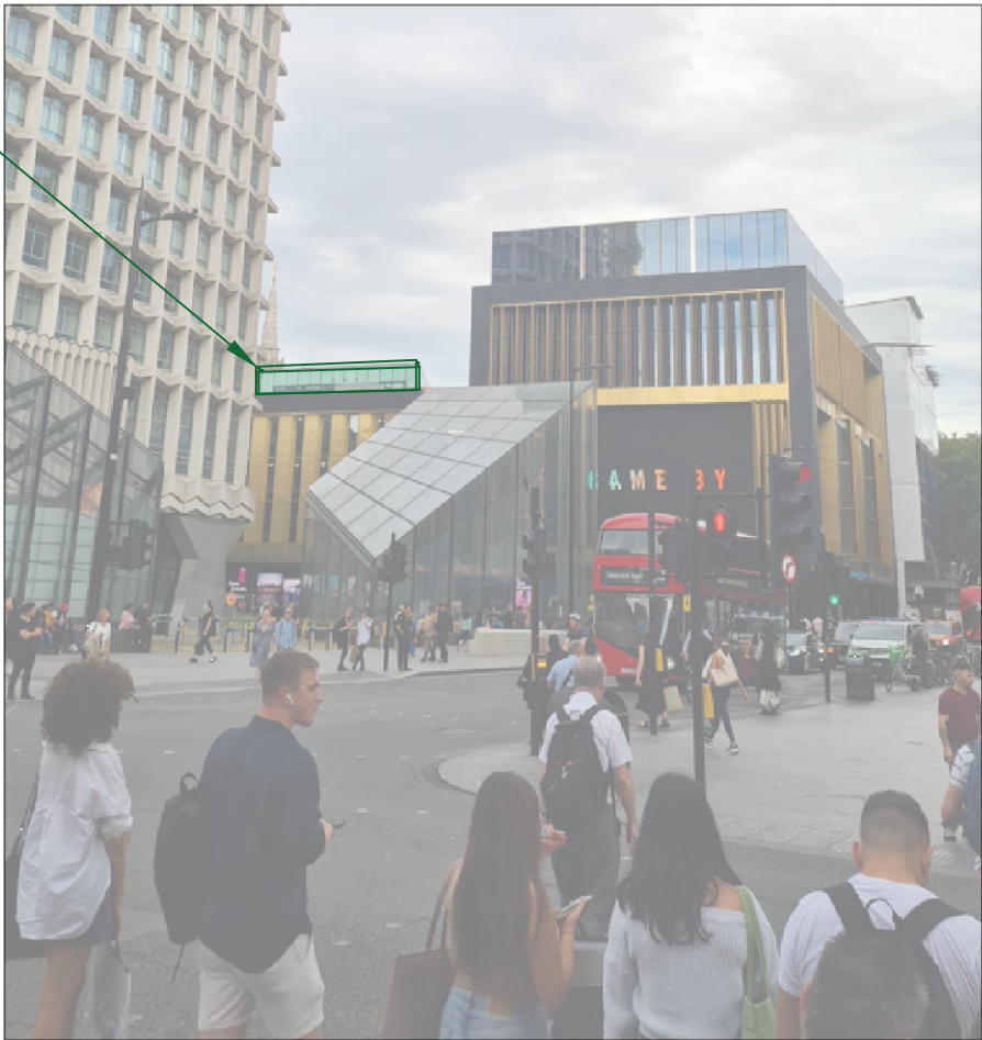
2 PHOTO SURVEY DIAGRAM - VIEW 2 N.T.S