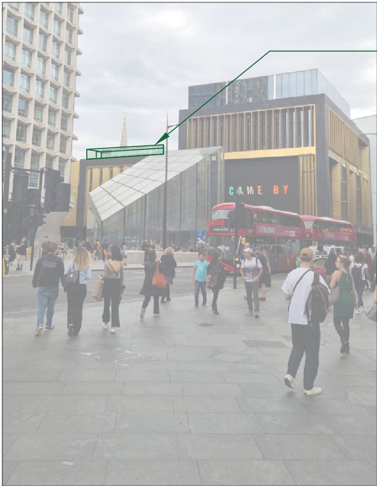
3 PHOTO SURVEY DIAGRAM - VIEW 3 N.T.S