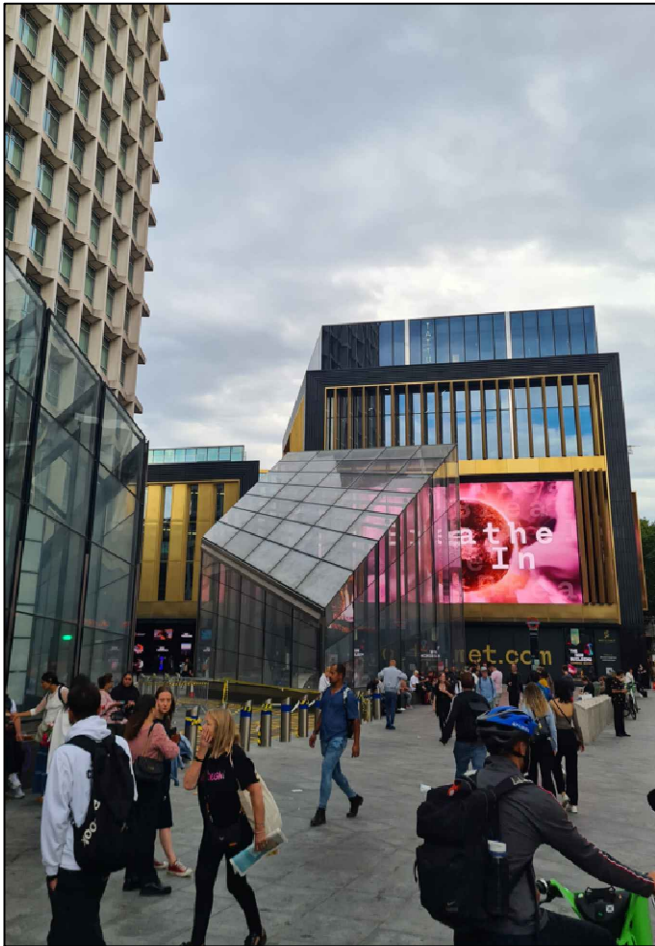
1 PHOTO SURVEY - VIEW 1 N.T.S