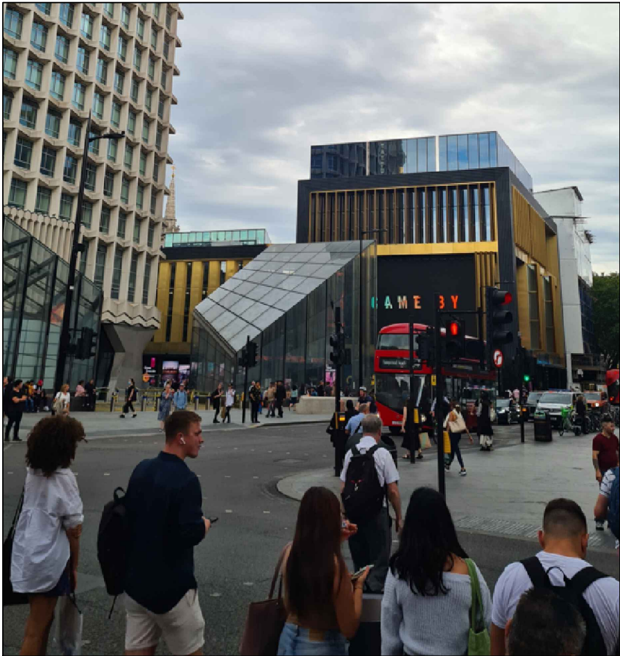
2 PHOTO SURVEY - VIEW 2 N.T.S